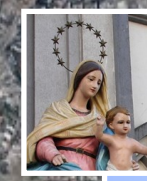
Nossa Senhora da Consolação