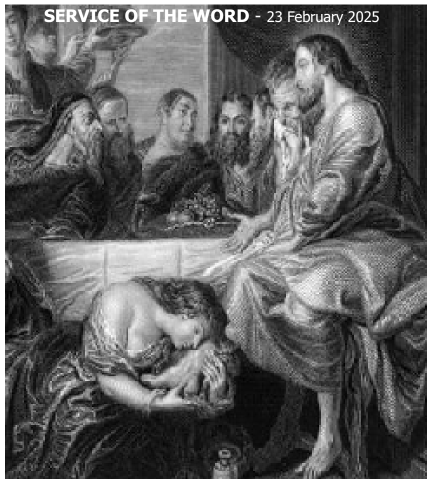
Jesus Having His Feet Anointed