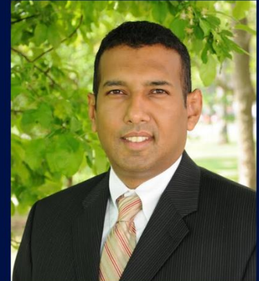
Mayor Mohammed Hameeduddin

WEEKLY LECTURE SERIES TUESDAY, JUNE 9 AT 2:00PM