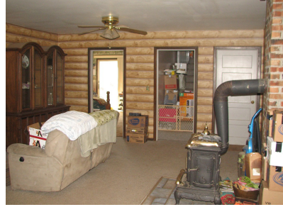
Front Room has Log-Look Wall Covering