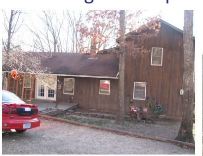
1½ Story, 4 BR Home