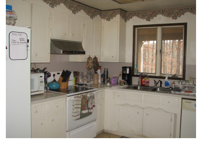
Cozy Kitchen Open To Front Room

Terms: Property will sell subject to court approval. Highest bidder will give 20% down as earnest funds. If the court approves the sale, the 20% will be placed in escrow at the title company, and closing will take place in approx. 45 days. If the sale is not approved, the money will be returned to buyer. If approved, at closing the taxes will be prorated and the seller will furnish title policy insuring good title to buyer.