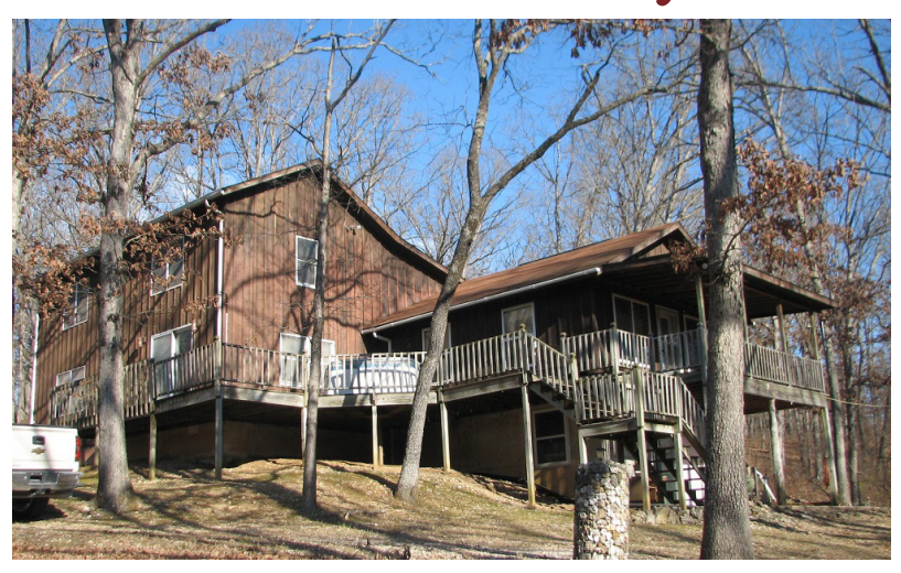
Decks Facing The Lake