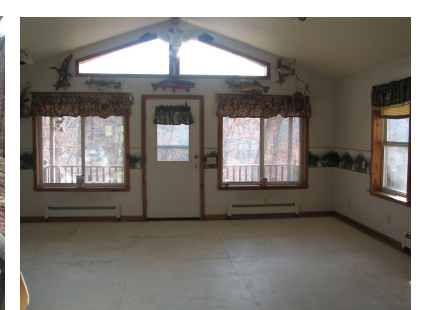
Livingroom With Spacious Windows