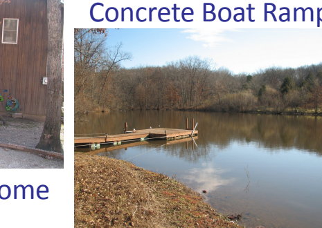
Nice Fishing Dock