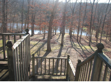
Wrap Around Deck Overlooks Lake