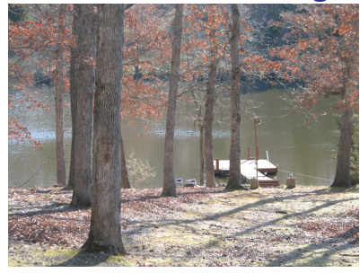
1½ Acre Stocked Lake Has Dock & Small Concrete Boat Ramp