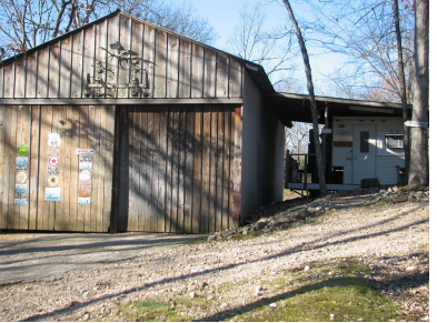
ATV Storage & Camper