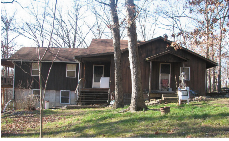
East Side of Home

42+/- Acres of Ozark Beauty with a 4 Bedroom Home! The cedar-sided home is nestled back in the native woodlands. The property has walking and