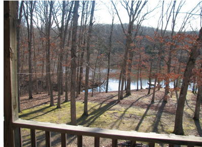
View of Lake From Deck