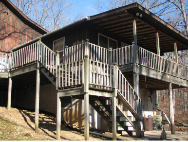
Wrap Around Deck With Hot Tub