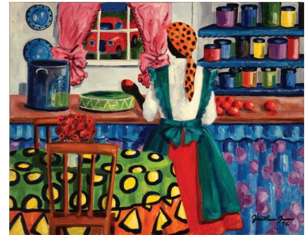
Red Tomatoes, 1992, Oil on Canvas, 16" x 10" © Jonathan Lipp

Claiming Your Health by Claiming Your History