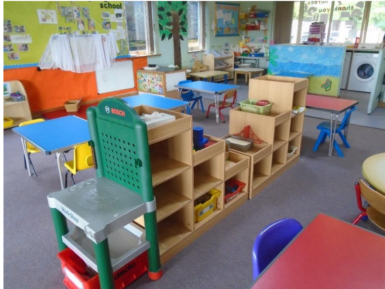
Construction toys in the foreground and art and craft and messy play in the back corner