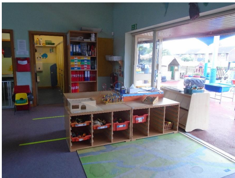
Small world on the mat such as farm, dinosaurs, sea life, cars and road