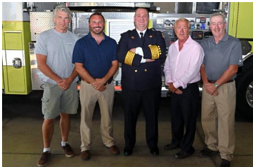
The BST&G Fire Board & Chief