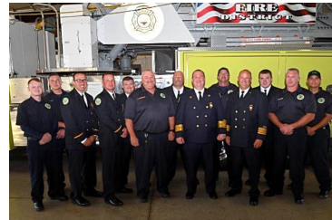
The BST&G Fire Department