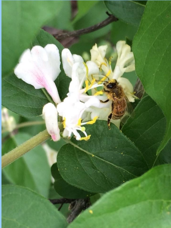
May 2 - Asian Honeysuckle, Berryton, KS