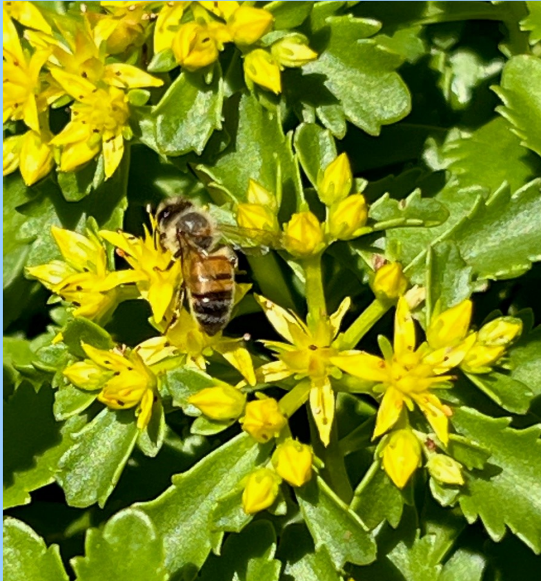
June 2 – Sedum, Auburn, KS