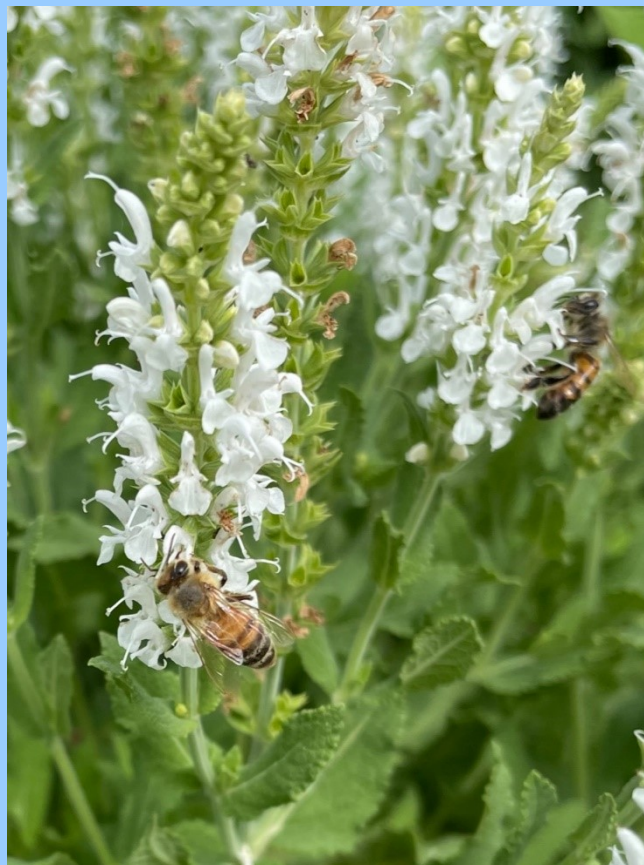
May 23 – Meadow Sage Salvia 'Snow Hill', Berryton, KS