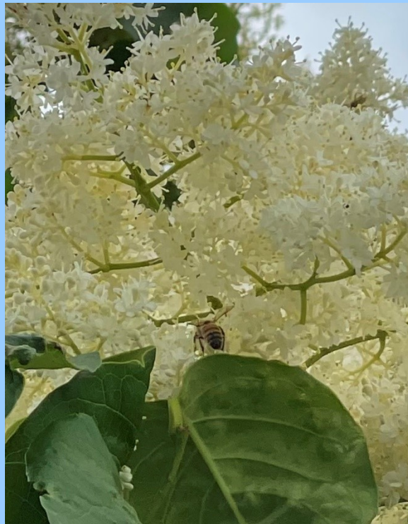
June 4 – Japanese Lilac Tree, Lawrence, KS – C. Burkhead