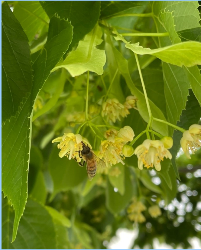
June 4 – Littleleaf Linden, Lawrence, KS – C. Burkhead