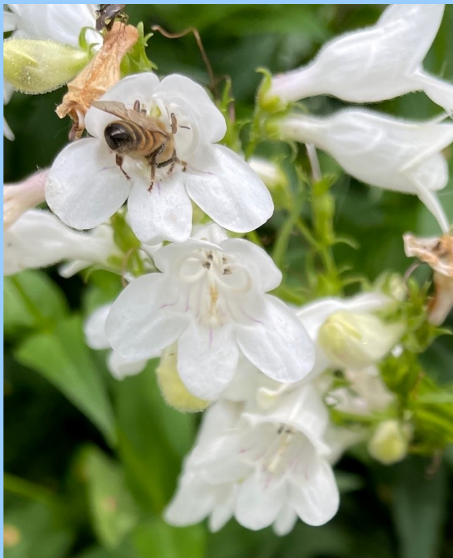
June 5 – Penstemon digitalis, Berryton, KS – C. Burkhead