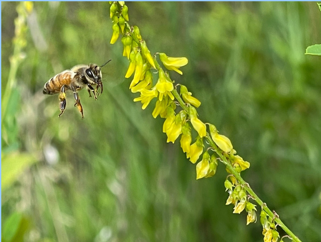
June 6 – Yellow Sweet Clover, Berryton, KS – C. Burkhead