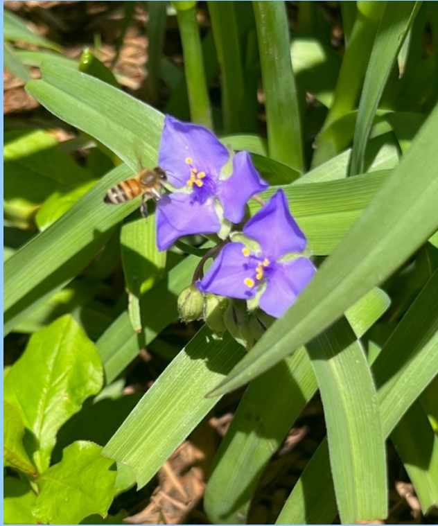
May 27 – Spiderwort, Auburn, KS