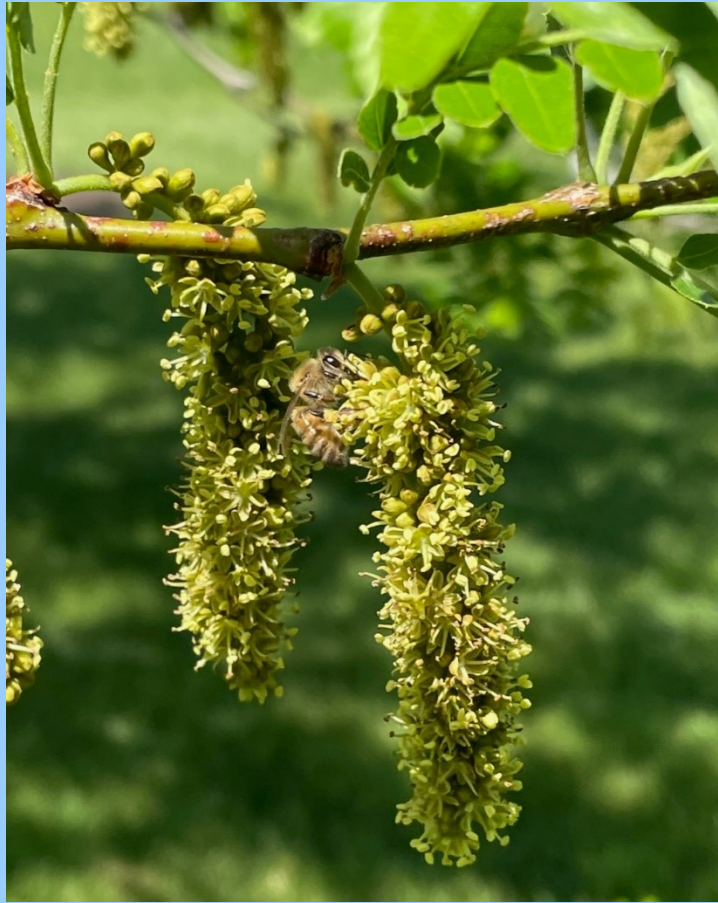
May 18 – Shademaster Honeylocust, Berryton, KS