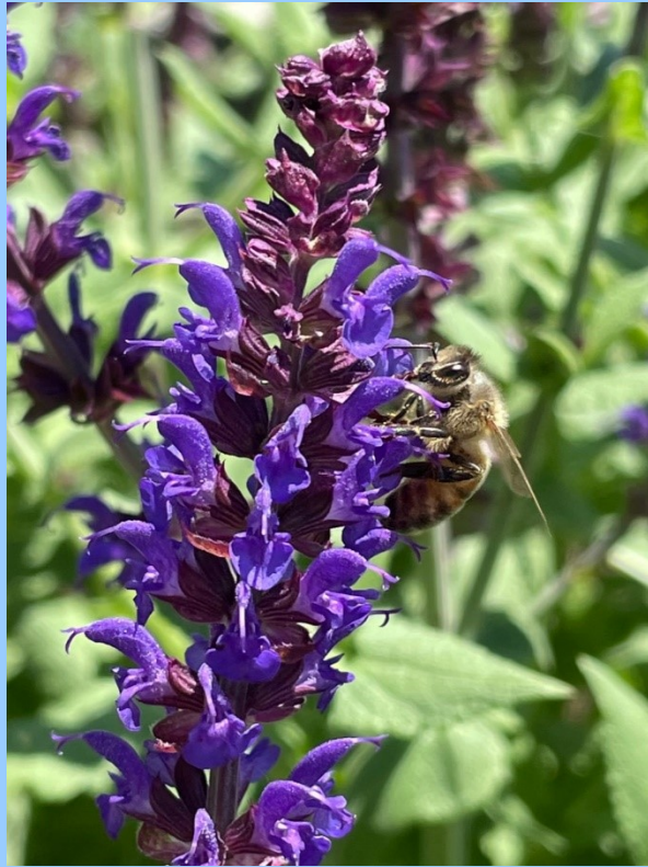
May 27 – Salvia 'May Night', Berryton, KS