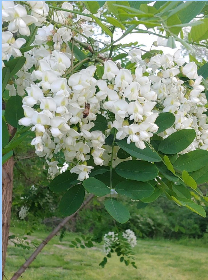
May 11- Black Locust, Olathe, KS