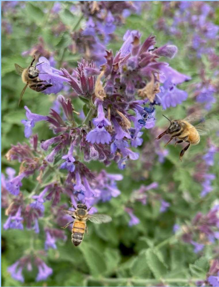
June 5 – Walker's Low Catmint, Berryton, KS – C. Burkhead