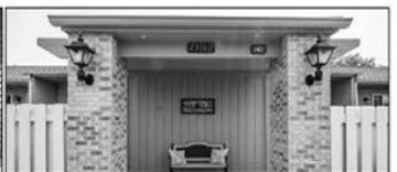
Jefferson Ct. • Colonial Acres