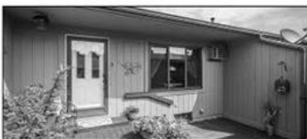
Adams Ct. • Colonial Acres

"We offer a competitive listing fee that we know would excite any seller"