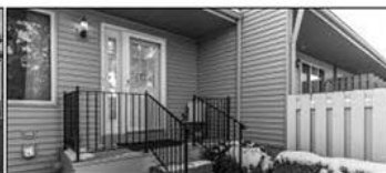
Alexandria • Colonial Acres