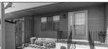
Arlington Circle • Colonial Acres