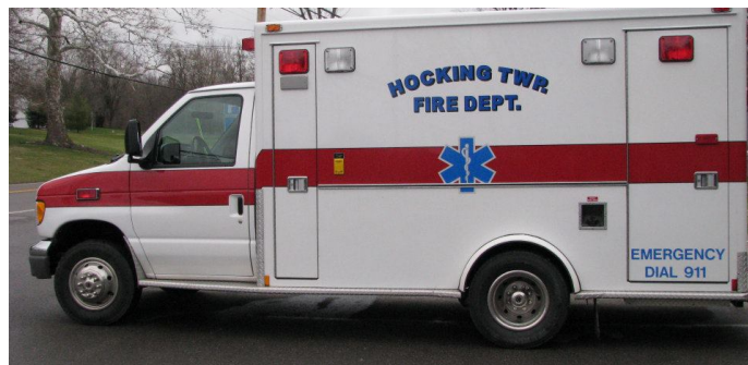
Reserve Squad 653