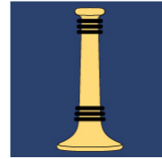
Lieutenant 653 Open Position