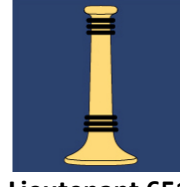
Lieutenant 651 Kyle Parlier Fleet Maintenance