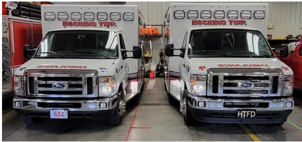
Medic/Squad 651 & 652