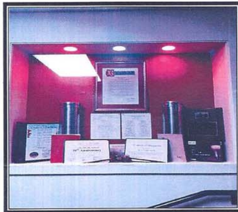
Taylor Middle School's 75 th Memorabilia and Time Capsule Showcase Located at Taylor Middle School/A-Wing Hall (Across from front office)

Your donation of $350 supported our efforts in holding historical records and objects representing the current culture of Taylor Middle School for preservation until discovery at a future time period. We are honored to celebrate Taylor Middle School and its history of success. Your generous donation will live in history as we celebrate this monumental anniversary.