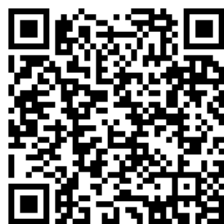
Table sponsorships and tickets are available now!

Join us for this once-in-a-lifetime opportunity on March 14, 2025