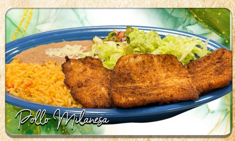
*Consuming eggs, raw or undercooking meats may increase your risk of foodborne illness specially if you have certain medical conditions.