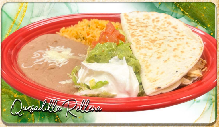
*Consuming eggs, raw or undercooking meats may increase you<mark>r</mark> risk of foodborne illness specially if you have certain medical conditions.