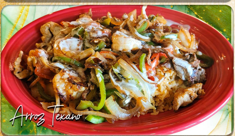
*Consuming eggs, raw or undercooking meats may increase your risk of foodborne illness specially if you have certain medical conditions.