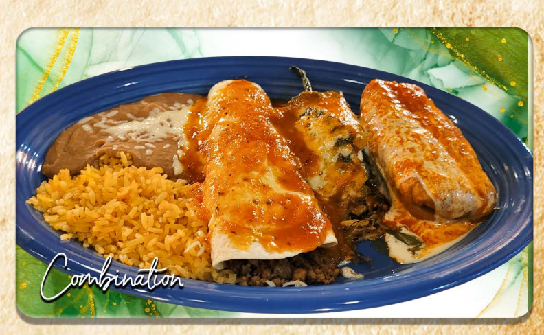
*Consuming eggs, raw or undercooking meats may increase your risk of foodborne illness specially if you have certain medical conditions.