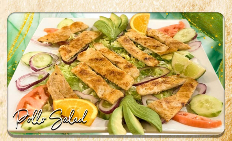
*Consuming eggs, raw or undercooking meats may increase your risk of foodborne illness specially if you have certain medical conditions.