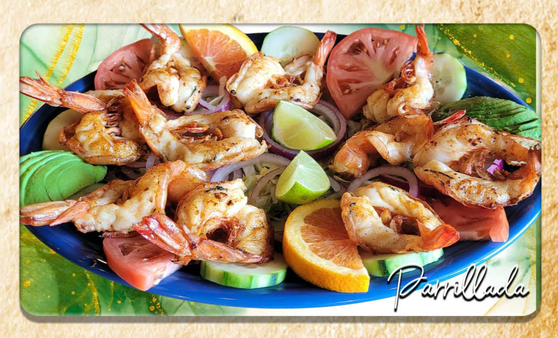
*Consuming eggs, raw or undercook<mark>i</mark>ng meats may increase your risk of foodborne illness specially if you have certain medical conditions.