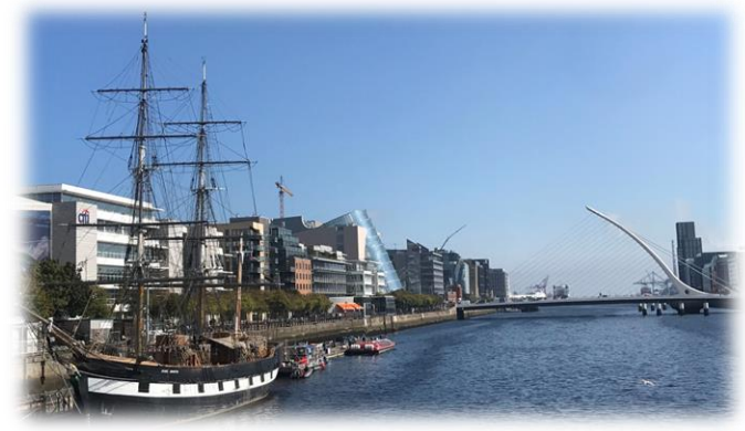
Famine ship, River Liffey, Dublin.