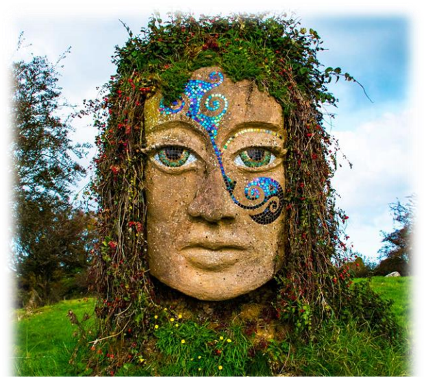
Stone carving, Hill of Usineach