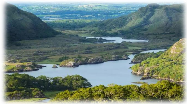
Ring of Kerry