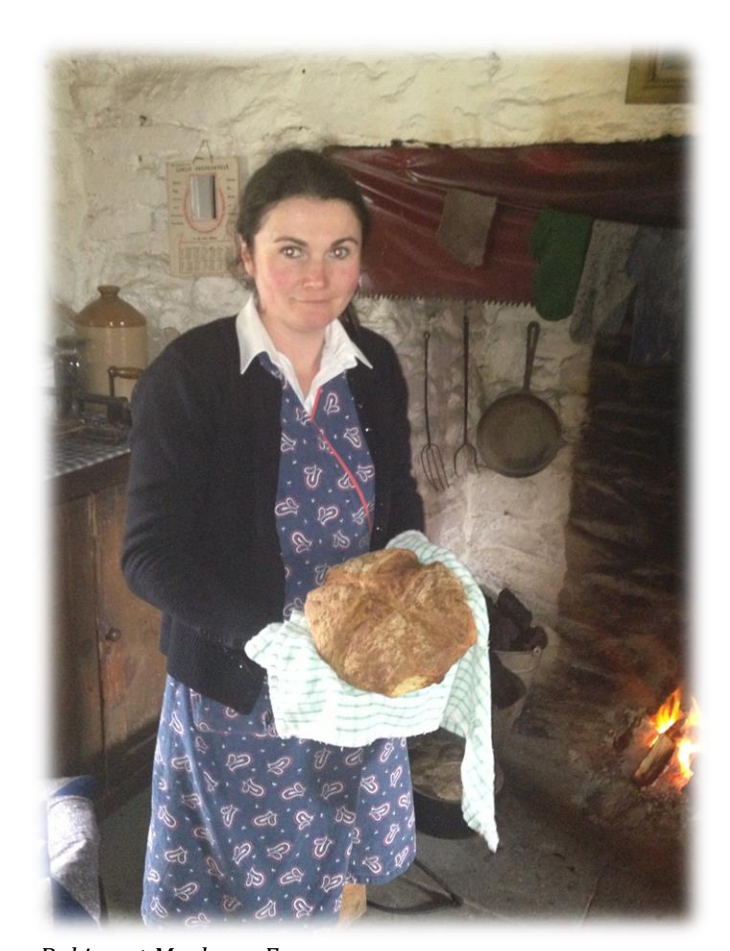
Baking at Muckross Farm