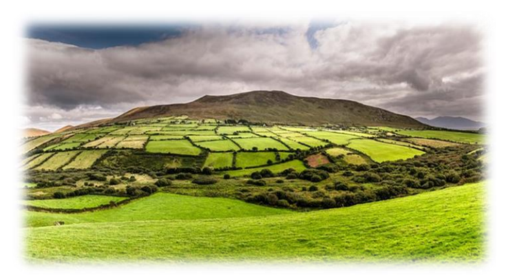
Lush green countryside