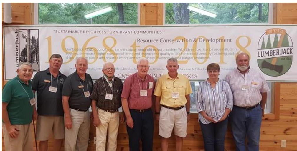
Council Members attending Lumberjack's 50 th Anniversary Celebration in August 2018