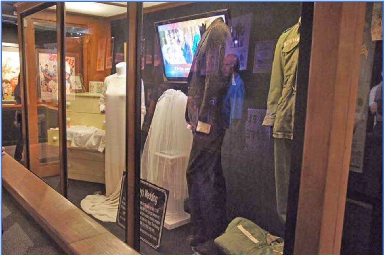
Elvis's and Pricilla's wedding clothes.