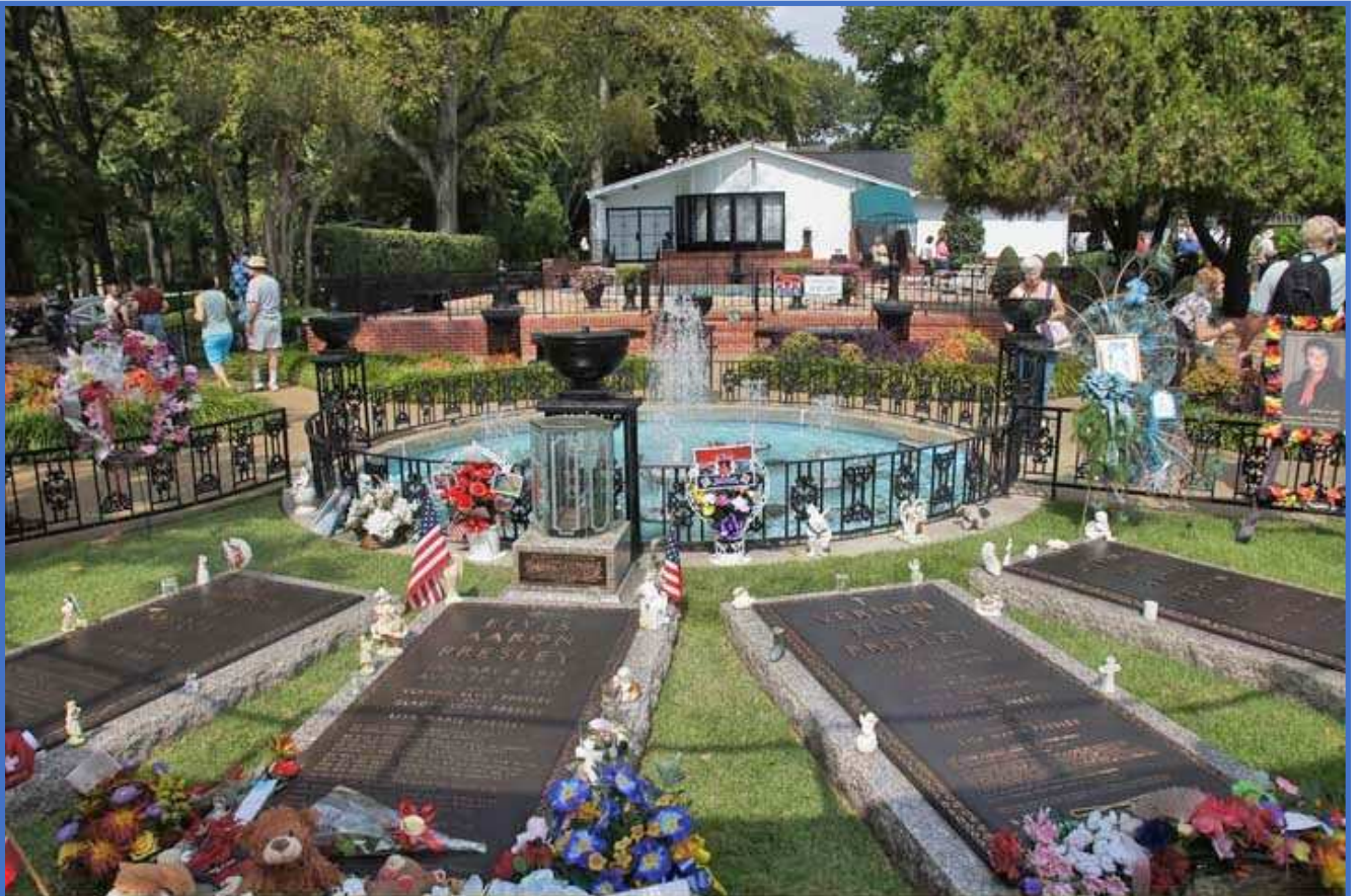
Another view of the graves.