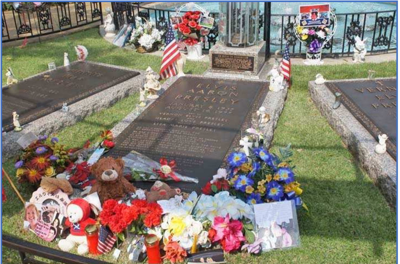
Evis's grave with lots of gifts. The one on the left with the writing on it is from Japan.