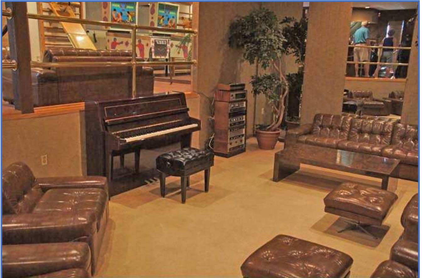
Another view of the recreation room.