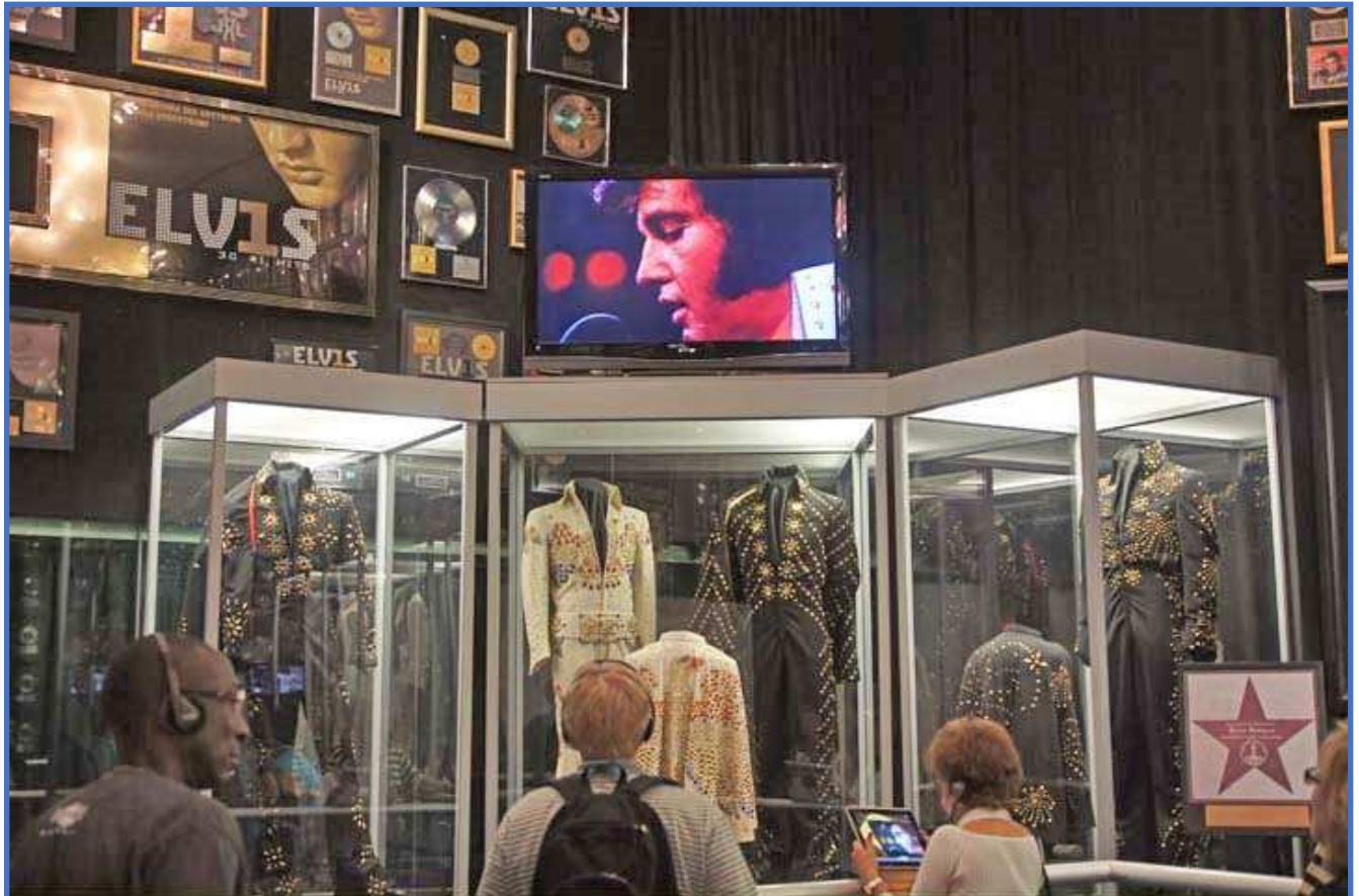
Awards, costumes and a TV showing one of his performances.