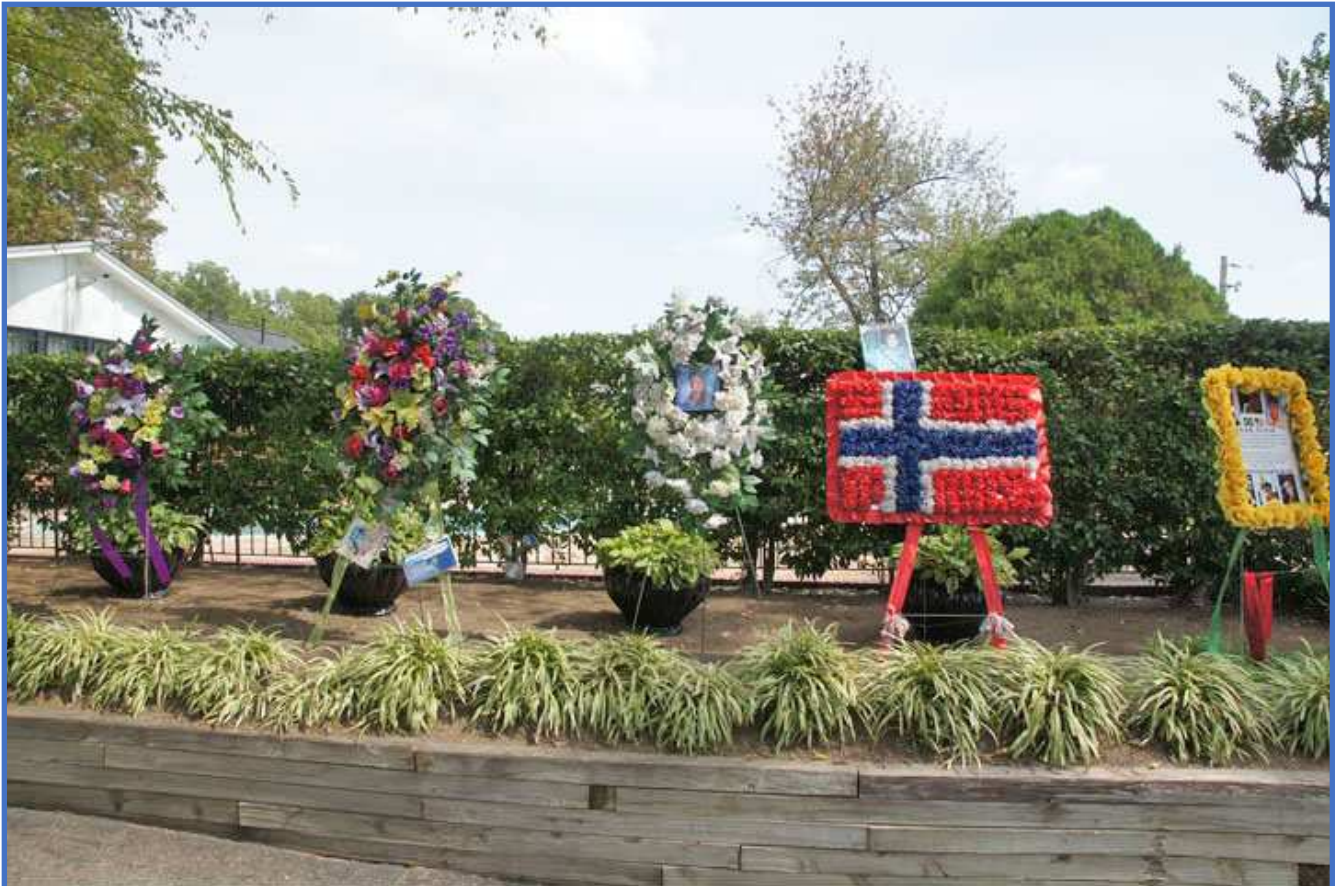
Flowers from visiting groups.