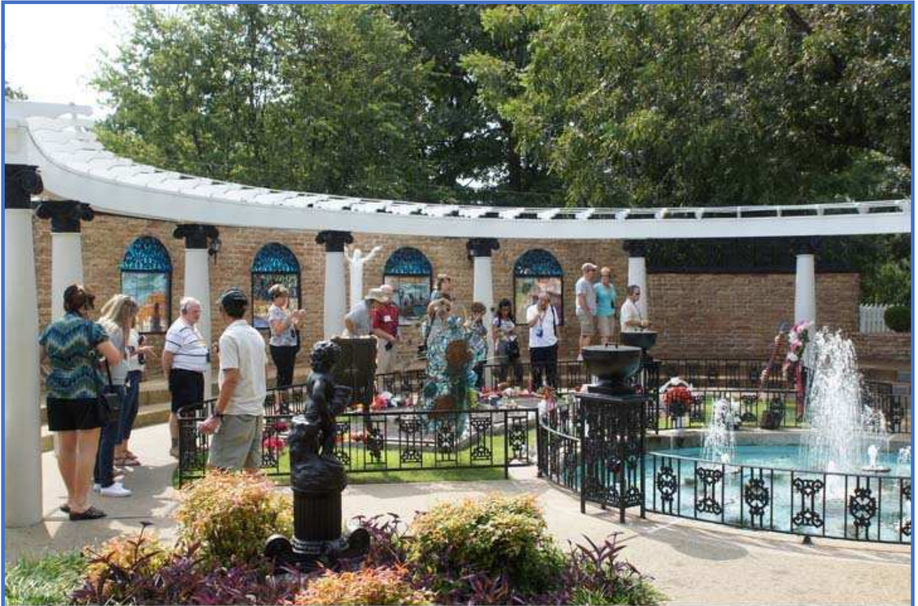
Nearing the graves.