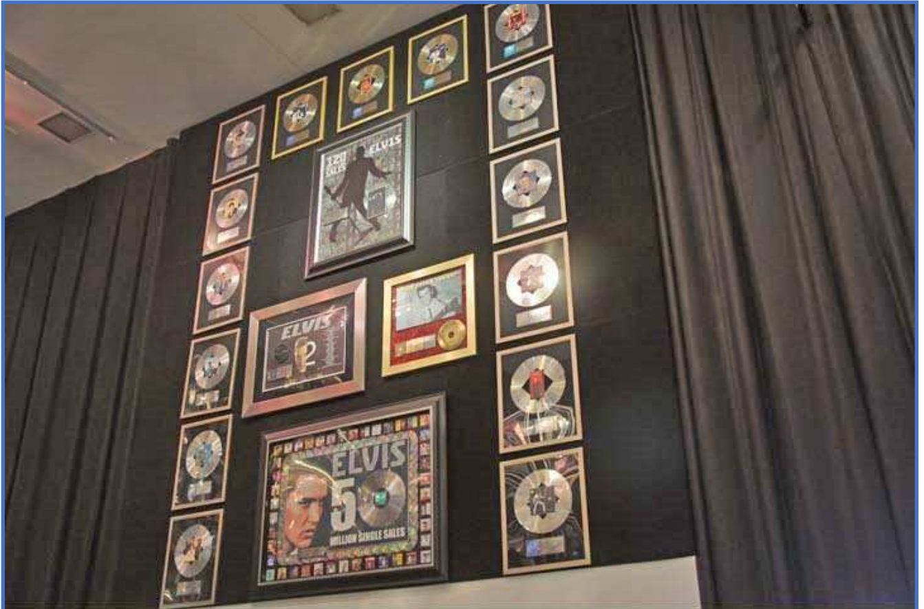
Awards and U.S. postage stamps.