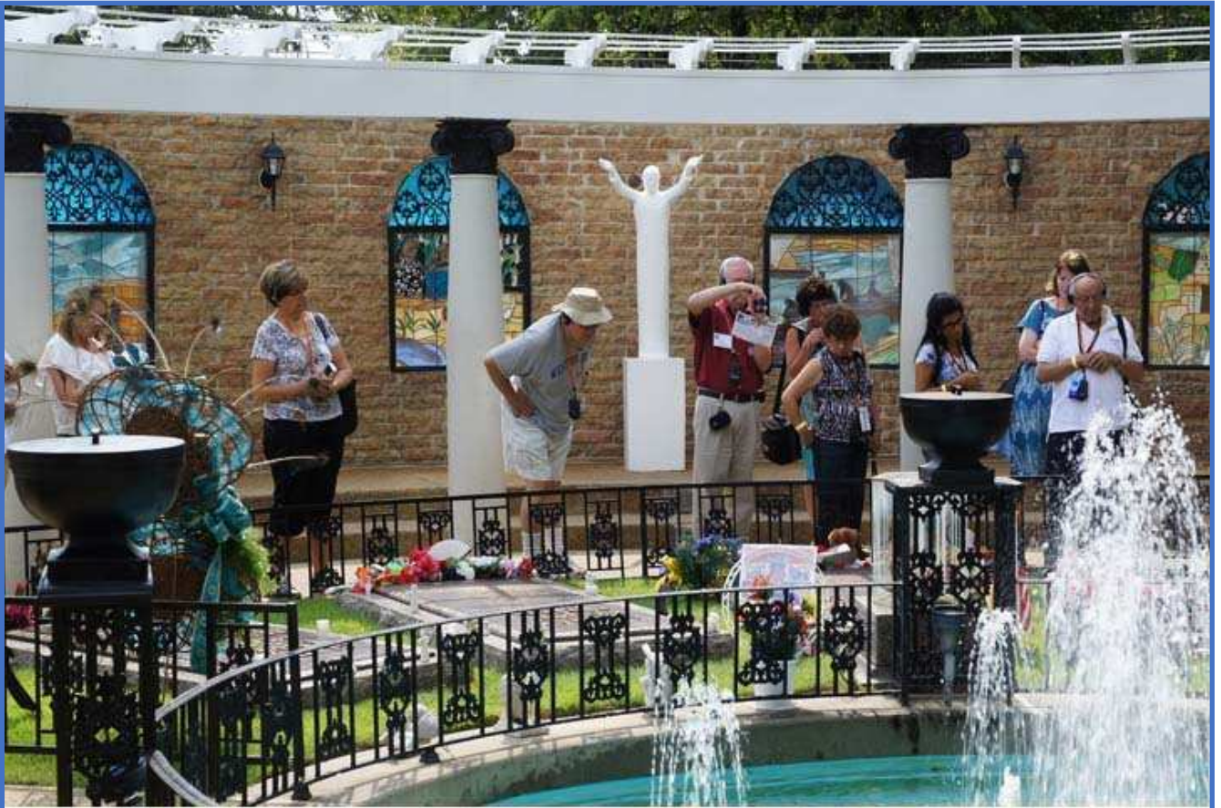
Again, near the graves.