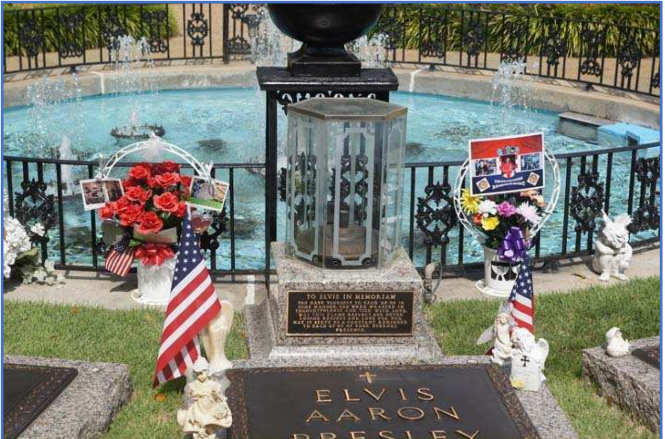
A closer view of Elvis's marker.