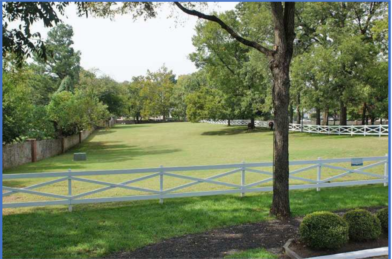
A very well groomed pasture.