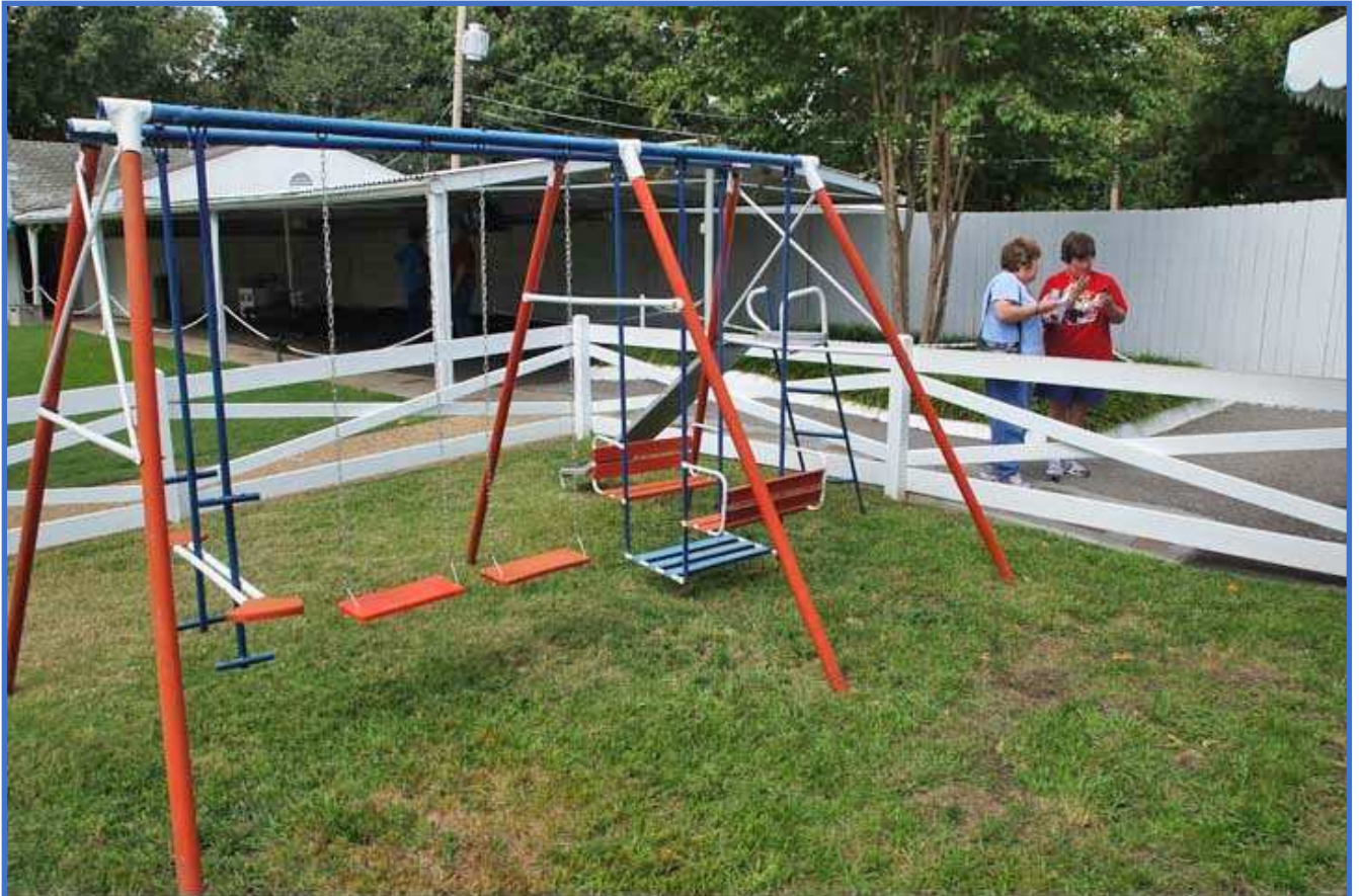
An outdoor play area.