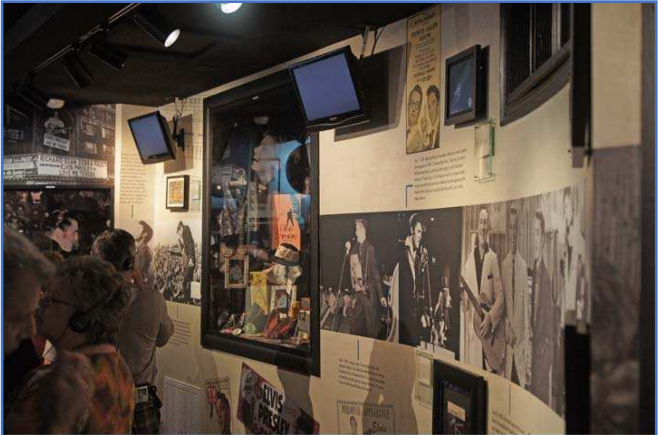
Inside the museum.