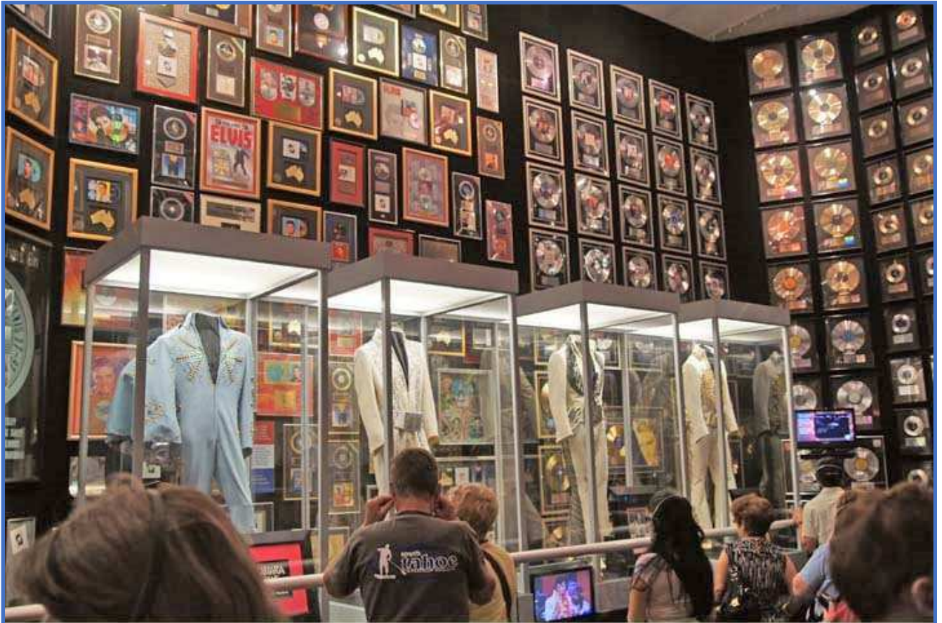
More awards and more costumes.