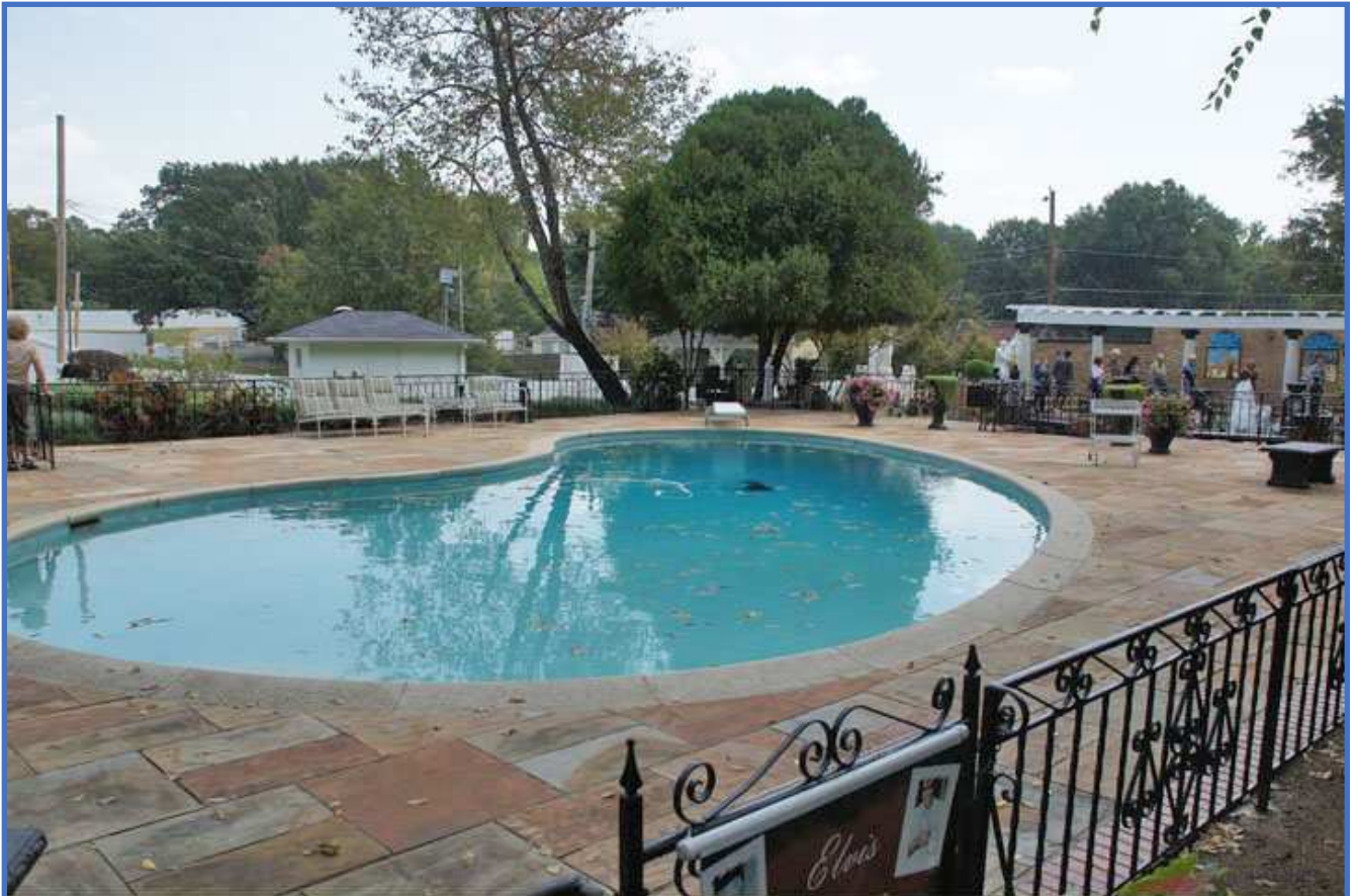
Another view of the swimming pool.