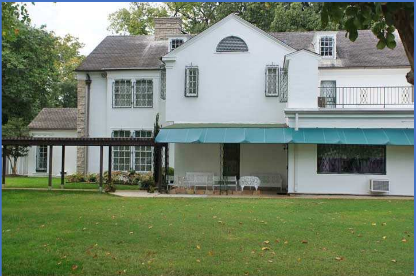
Another view of the back of the mansion.