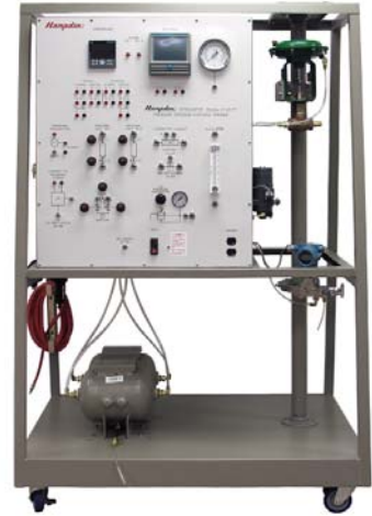
MODEL H-ICS-PT Pressure Process Trainer