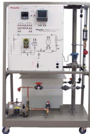
MODEL H-ICS-FT Flow Process Control Trainer