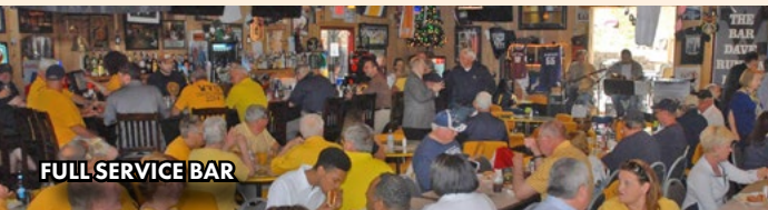
FULL SERVICE BAR

Calacino's has a long standing tradition of providing entertainment to patrons of Beckley in a fun and friendly environment. Join us in the Greek's Locker Room for great food, live music, major sporting events, and unforgettable special events.