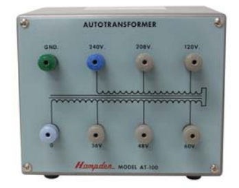
Dimensions: 7" H x 9" W x 7" D Shipping Weight: 15 lbs

The Model CT-100A is an encapsulated secondary winding used to isolate instrumentation from the primary circuit, or to step-down current to match instrument ranges. The basic range is 200:5 Amp with other current ratios depending on the number of loops formed by the primary circuit conductor around the core.