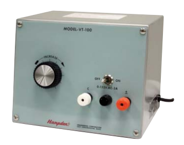
Dimensions: 7½" H x 9" W x 7" D Shipping Weight: 20 lbs

The Model T-100A is a single-phase transformer with two secondaries; rated 120 voltamperes at 60Hz. Several of these transformers may be interconnected to demonstrate series, parallel, or three-phase configurations.