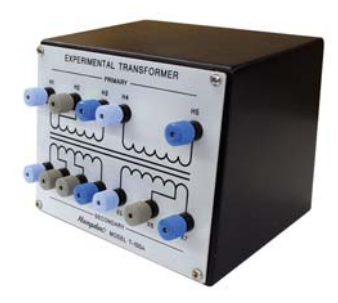
Dimensions: 7" H x 9" W x 7" D Shipping Weight: 15 lbs

The Model AT-100 is a multi-tapped autotransformer rated 240 volt-amperes at 60Hz, which may be used either for stepping up or stepping-down voltages. For convenience, the noload voltage values are silkscreened on the front.