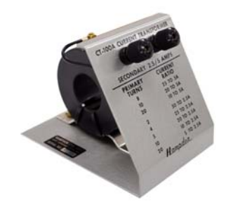
Dimensions: 5" H x 4½" W x 7½" D Shipping Weight: 10 lbs

The Model T-100-3A contains three transformers of the type used in the Model ET-100 and T-100A. All transformer leads terminate at socket receptacles on the front panel. Standard symbols and legends are silkscreened on the panel. Each of the three transformers in the Model T-100-3A may be used independently or the three may be interconnected into wye and delta configurations.