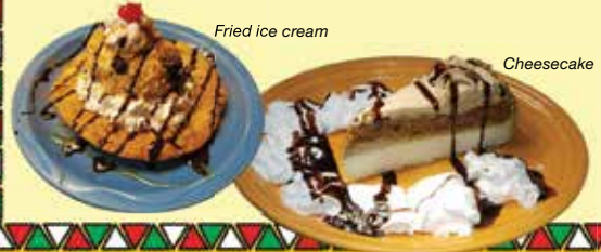
Fried ice cream