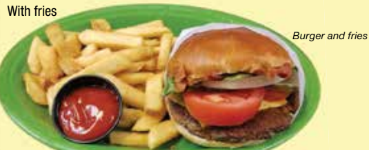
Burger and fries