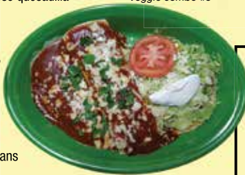
Veggie combo #3