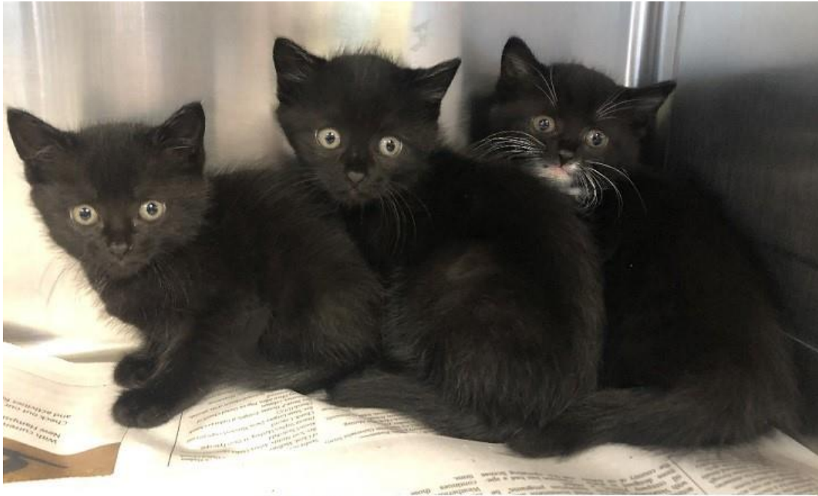
The Roger Road Three!