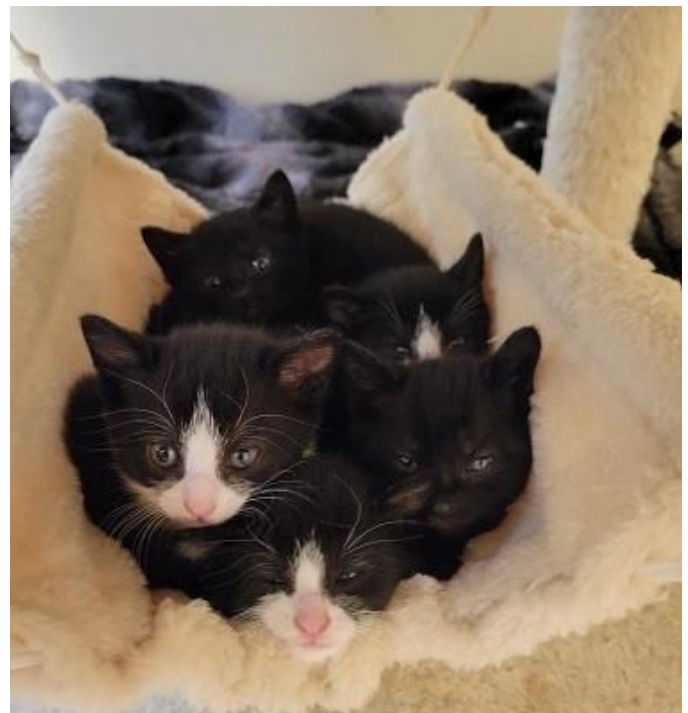
Kittens by the hammock-full from Riverledge!