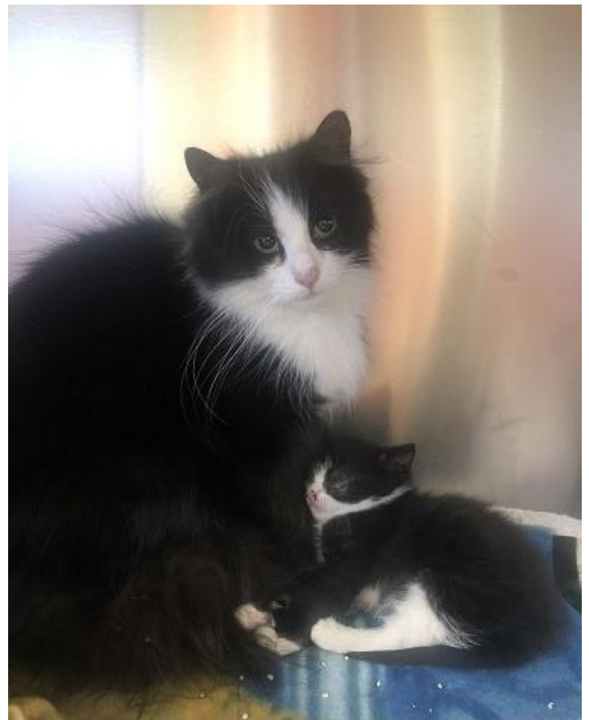
Mother and kitten from Rachael Circle