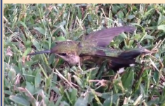
Image: Hummingbird, unable to fly, stuck in littered chewing gum.

Many people who would never litter don't think twice about spitting out their chewing gum in nature.