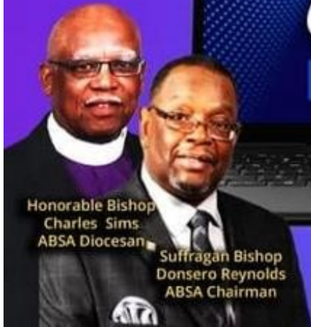
Honorable Bishop Charles Sims ABSA Diocesan