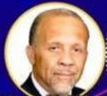
Honorable Bishop Charles Finnell Saturday, 11/14 - 9:30AM