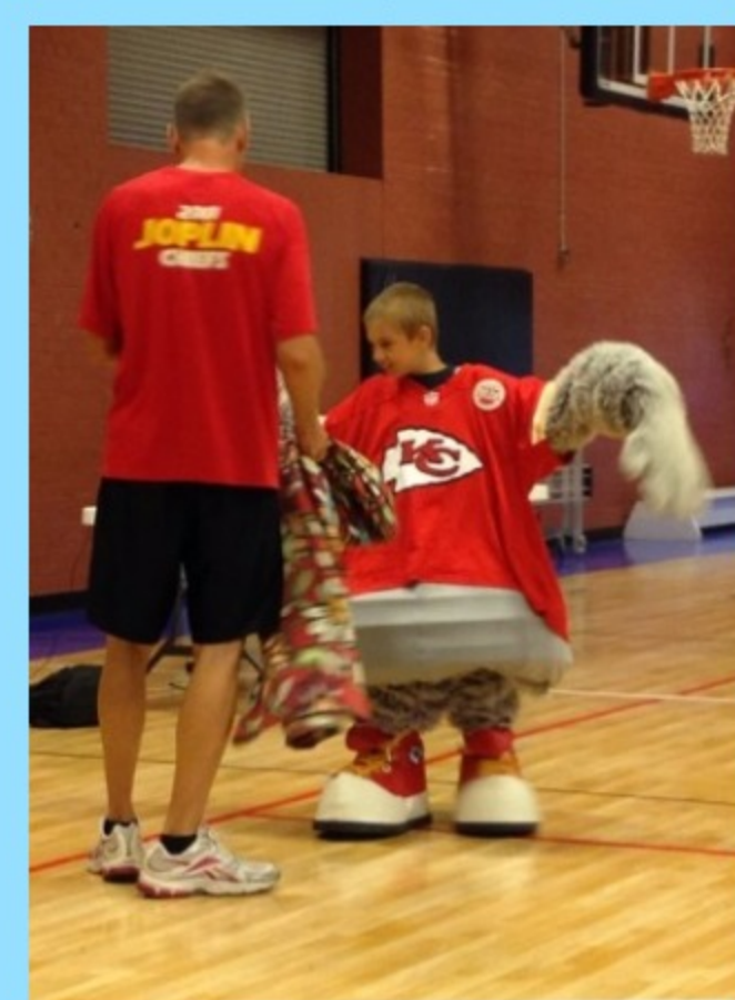
Read to Succeed with K.C. Wolf