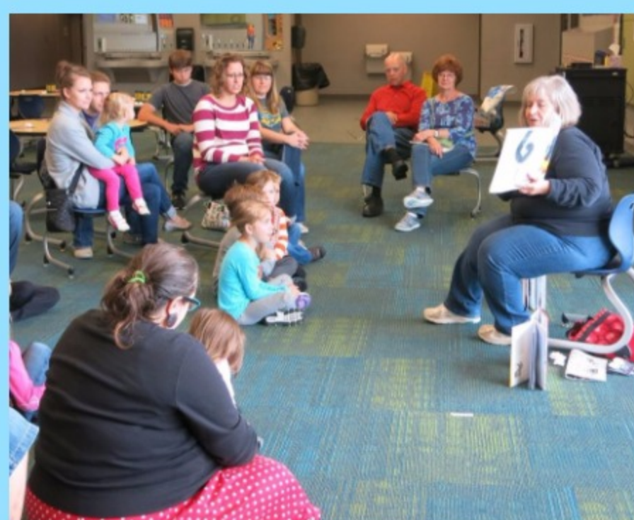
Celebrate the book