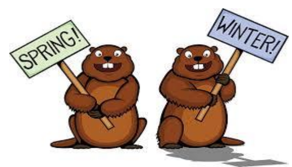
Groundhog Day-February 2nd

1/18/1937 The 25 millionth Ford was produced 1/30/1942 Auto production was ended for the duration of the war 2/15/1954 Thunderbird was selected as the name for new sports car.