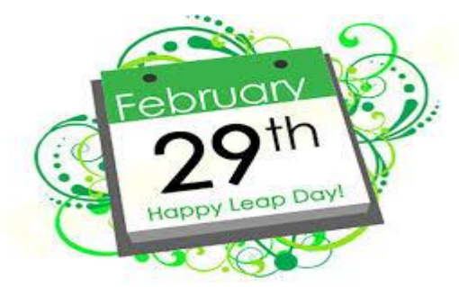
Also called Bachelor's Day - single guys beware