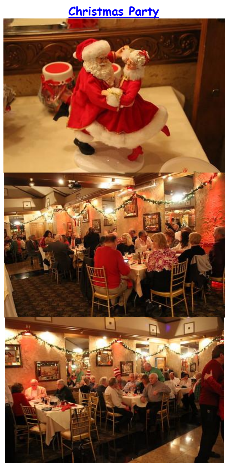
Thanks to Joanne for all the pictures

Car Shows-Swap Meets 1/17-19 Allentown, PA Swap Meet