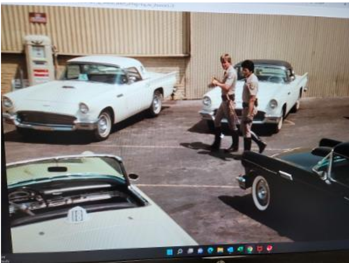
From Vince (CHIPS TV Show)