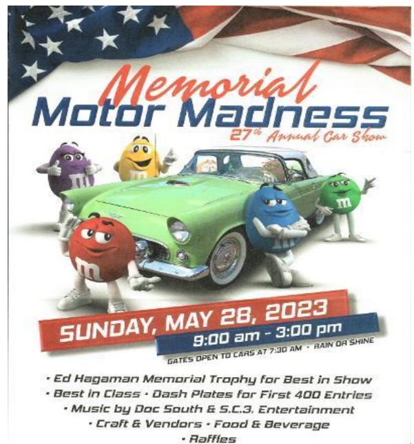
Mike Meehan's car on show flyer

Henry Ford made 8 different models of cars - A, B, C, F, K, N, R, S before producing the famous Model T