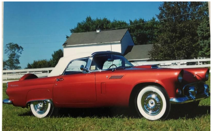
Tom Mirros 56 (see page 6)

That's about all for now. Stay healthy and enjoy the Spring Pat LeStrange