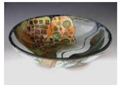
Example of glass piece made using techniques from this class.