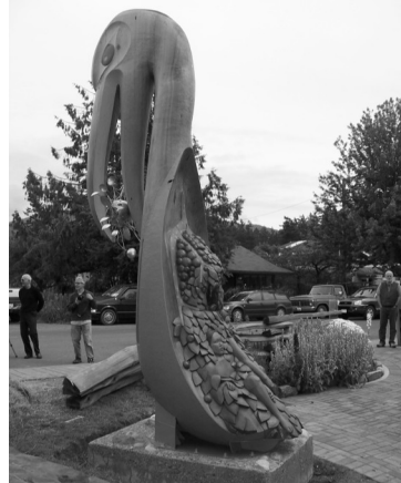
Left: The sculpture "Tribute" at rest in it's new home in front of the Orcas Island Historical Museum on North Beach Road.