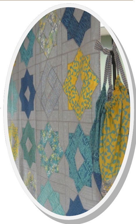
2015 Raffle Quilt