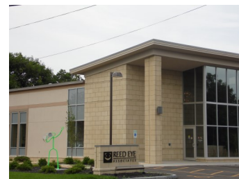
Reed Eye Center