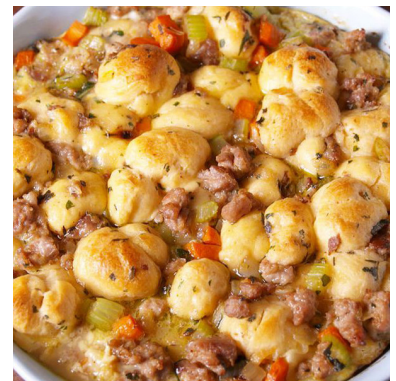
Photo & recipe courtesy of delish.com https://warranty.life/2DN1tH4

4. Cut crescent roll triangles into thirds then roll each piece into a ball. In a large bowl, combine crescent roll balls with sausage mixture, egg and chicken stock. Transfer to a medium casserole dish. Bake for 45-60 minutes, until the top is golden brown and the dough is cooked through. If the topping is browning too quickly, cover the dish with foil.