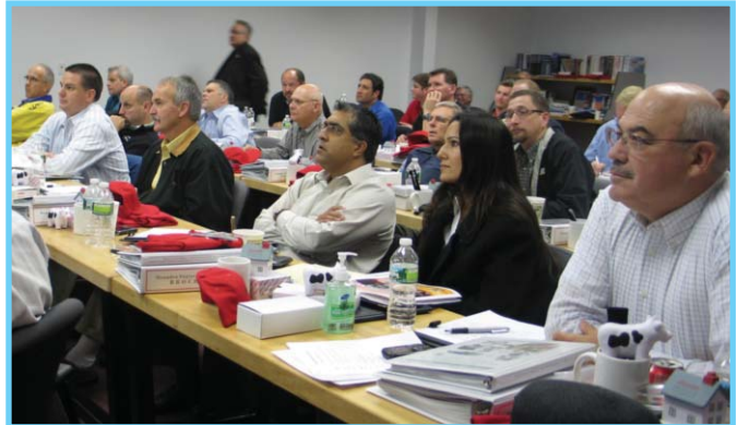
Onsite Training Available