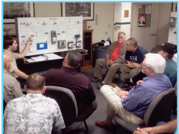
Field Training Available