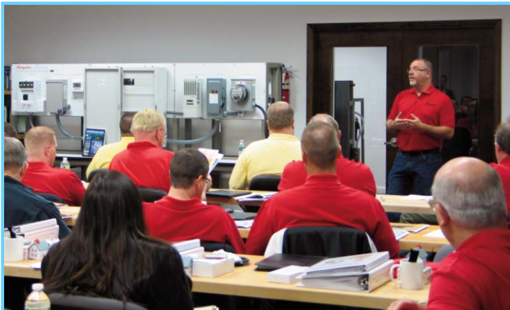
Factory and Field Training Available