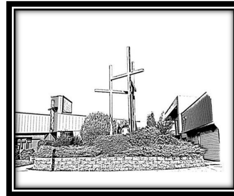
Kasson United Methodist Church

Pleasant Corners United Methodist Church