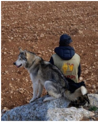
Me observing the ploughing, along with one of the settlers' dogs