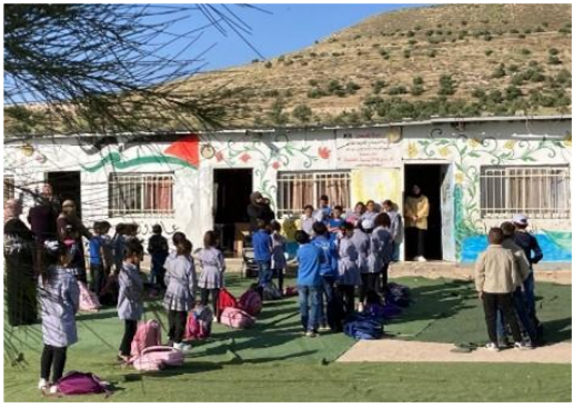
Photo: Jubbet ad-Dhib school before it was demolished