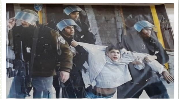
Examples of Palestinian children's interactions with Israeli soldiers in H2, Hebron

Returning to Australia and comparing the educational experience of Australian children highlighted just how extreme the situation in the Occupied Palestinian Territories really is. Education is such a vital element in the development and future of individuals and any society.