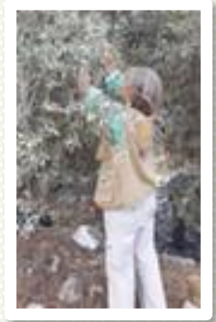
Supporting Palestinian families with the olive harvest in H2

Hebron is the only city in the West Bank with Israeli settlements in the centre of the city, and is divided between H1, controlled by the Palestinian Authority; and H2, controlled by Israel with around 2,000 soldiers to protect 600+ Israeli settlers who have taken over many Palestinian homes and buildings in the heart of the city.