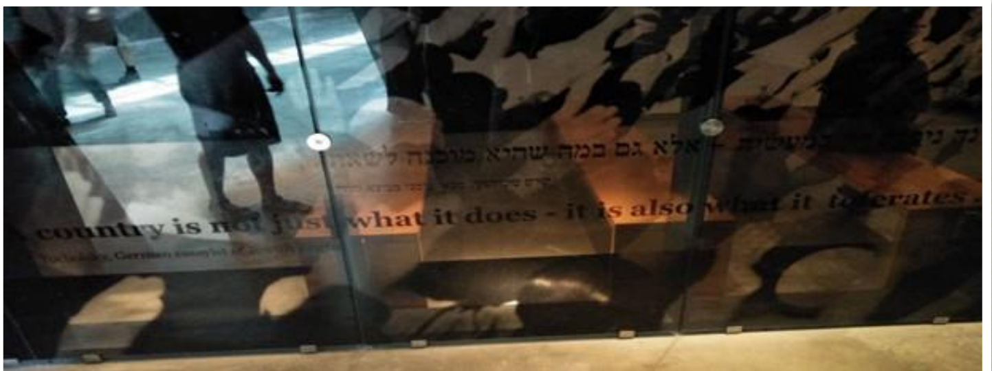
Photo taken at the entrance to Yad Vashem, Jerusalem; it reads: "A country is not just what it does - it is also what it tolerates"

I remember being alarmed as I realized that a Palestinian man with Down Syndrome did not understand soldiers' commands as he walked down the wrong lane at a checkpoint, and witnessed the soldiers bully and abuse him for this lack of understanding.