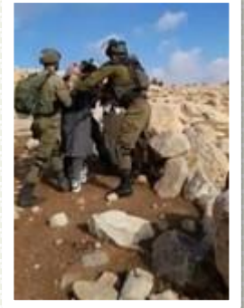
A Soldier-Settler (Yossi) and two soldiers attack Sabah.

One day, the shepherds were attacked by three soldiers. Sabah raced out to the field to intervene (she is multi-lingual). She started filming the attack. A soldier smashed her mobile and attacked her. One of the shepherds photographed the attack and shared the photos with me. Sabah suffered damage to tissue in her neck requiring weeks of medical treatment.