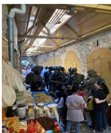
Weekly settler incursion into the Hebron souk

As space constraints prevent me from addressing these comprehensively, I will only relate two incidences of violence that we investigated.