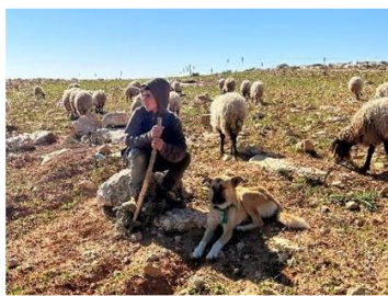
Israeli youth from Avigayil outpost using sheep to vandalise Palestinian crops