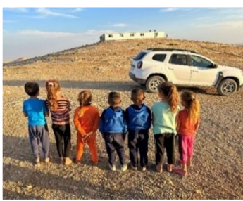
Children from Isfey al Fauqa showing us their new school