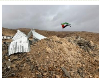
The destroyed school of Isfey al Fauqa 2 days later.