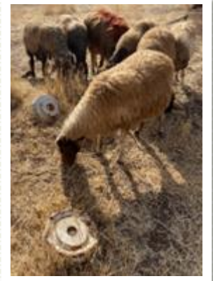
Sheep graze around anti-vehicle mines near the illegal settlement of Hemdat.

I became well acquainted with one community situated near the illegal settlements and military compounds of Hemdat and Ro’i. Several Palestinian families have lived there for generations eking an honest living working herds through hilly pastures. In recent years Settlers have used the neighbouring illegal settlements to establish outposts and expand their own agricultural operations into land owned by Palestinians. Zionist groups provide the manpower and funding for these operations, while the Israeli military emboldens them by providing escorts and the threat and use of force.