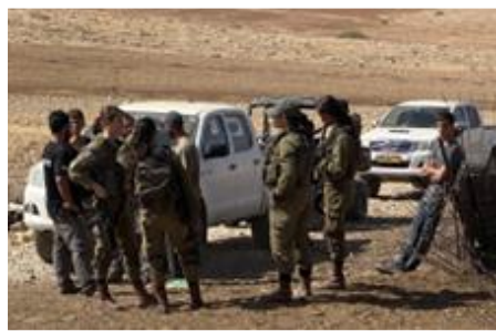
A group of armed Settlers persist with blocking the community’s access road, despite the presence of IDF and Israeli Police.

Even when unmolested during pastoral work, these Palestinians manage substantial dangers from unexploded ordinances scattered by the IDF, which I observed to include mortar shells, anti-vehicle mines, and hand grenades. Most families that we spoke with in these communities reported having lost at least one family member to UXO. They are routinely scattered throughout their fields and children frequently mistake UXO for toys. On 10 October I learned of the latest victim—a boy of about 10—who picked up UXO left in his family’s field while shepherding.