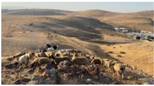
A shepherd and his flock weave through military compounds (right) and the illegal settlement of Hemdat (top left).

I am a community worker and law student from Meanjin, Brisbane. I deployed to the Jordan Valley as an Ecumenical Accompanier from August to November 2022 and travelled extensively through Israel and the West Bank. I observed ample prospects for peacebuilding: Palestinian communities committed to nonviolence and coexistence; Israeli civil society working to advance peace and human rights. I saw substantial investment in peacebuilding and humanitarian initiatives from foreign States and international civil society. This bona fide peacebuilding, however, creaks under constant pressure applied by hardliners who wield violence and hatred to dispossess, humiliate and violate human rights.