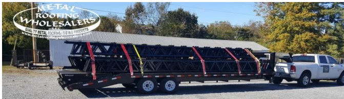
Bar Joist-Header Truss