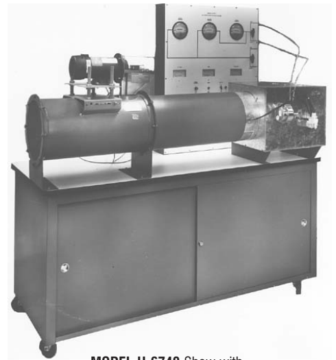
MODEL H-6740 Show with MODEL H-6740-10 High Velocity Experiment Package (Axial Fan)