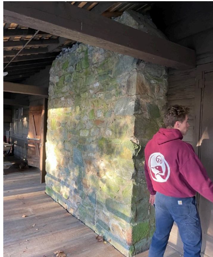
BEFORE WE STARTED