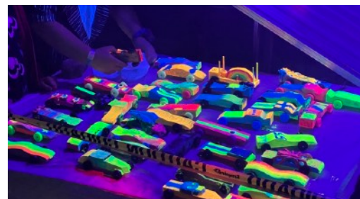
BLACK LIGHT PINEWOOD DERBY!

Many thanks to the 78ers that helped out these past 2 October weekends!