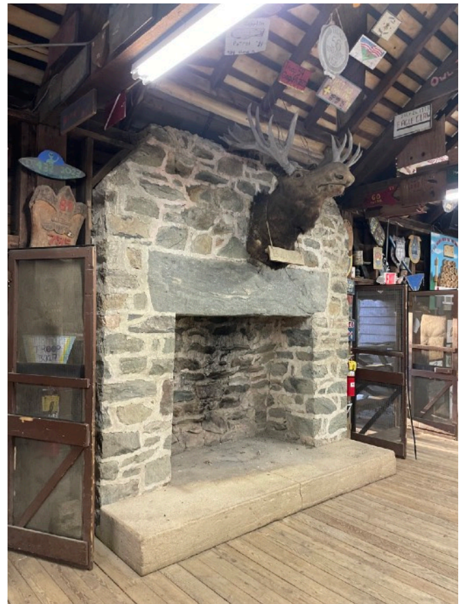
BEFORE WE STARTED

The crew made remarkable progress, clearing about half the fireplace. The balance will be removed on a subsequent workday, to be scheduled.