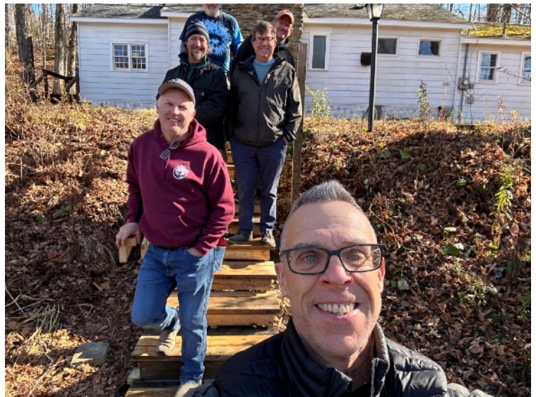
DEMONSTRATING THE SAFETY OF THE NEW STAIRS !