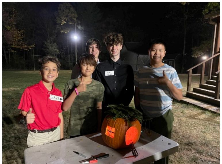
THE WINNING PUMPKIN !