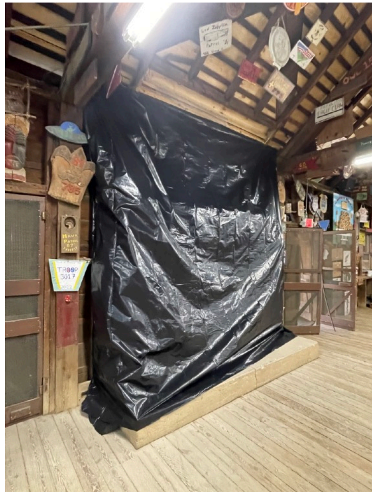
ALL BUTTONED UP !