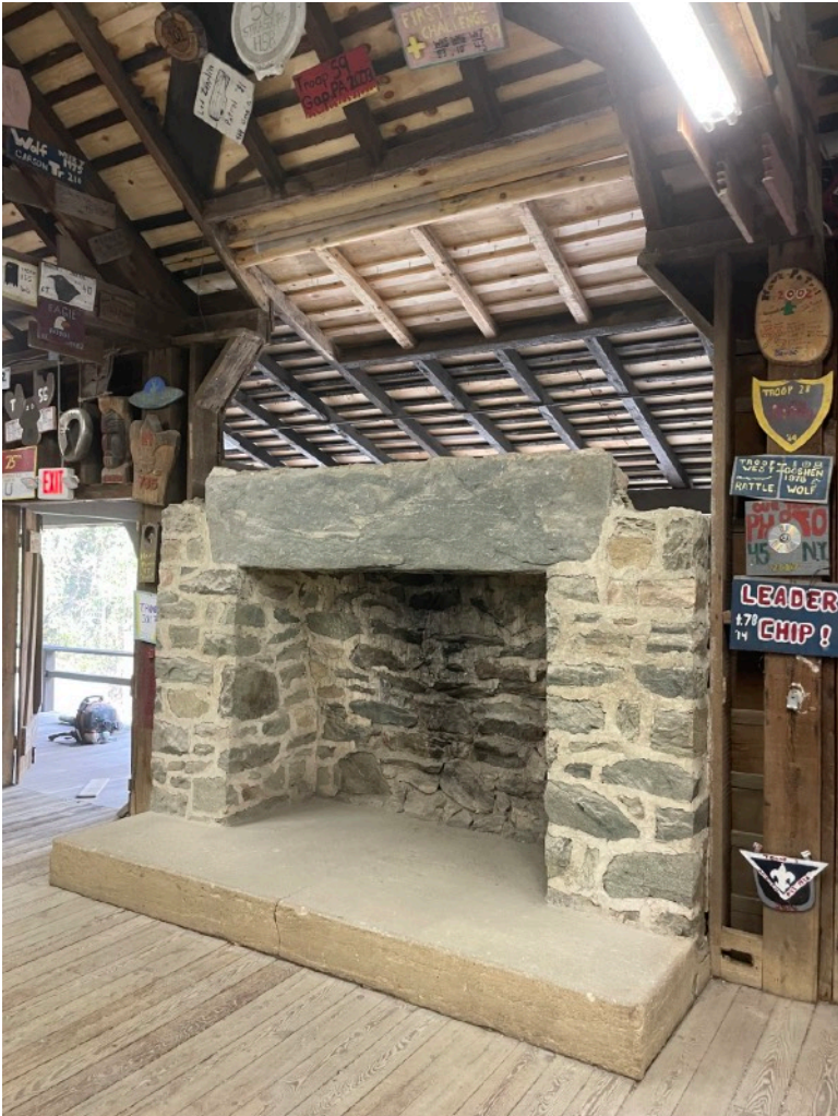
DONE FOR THE DAY