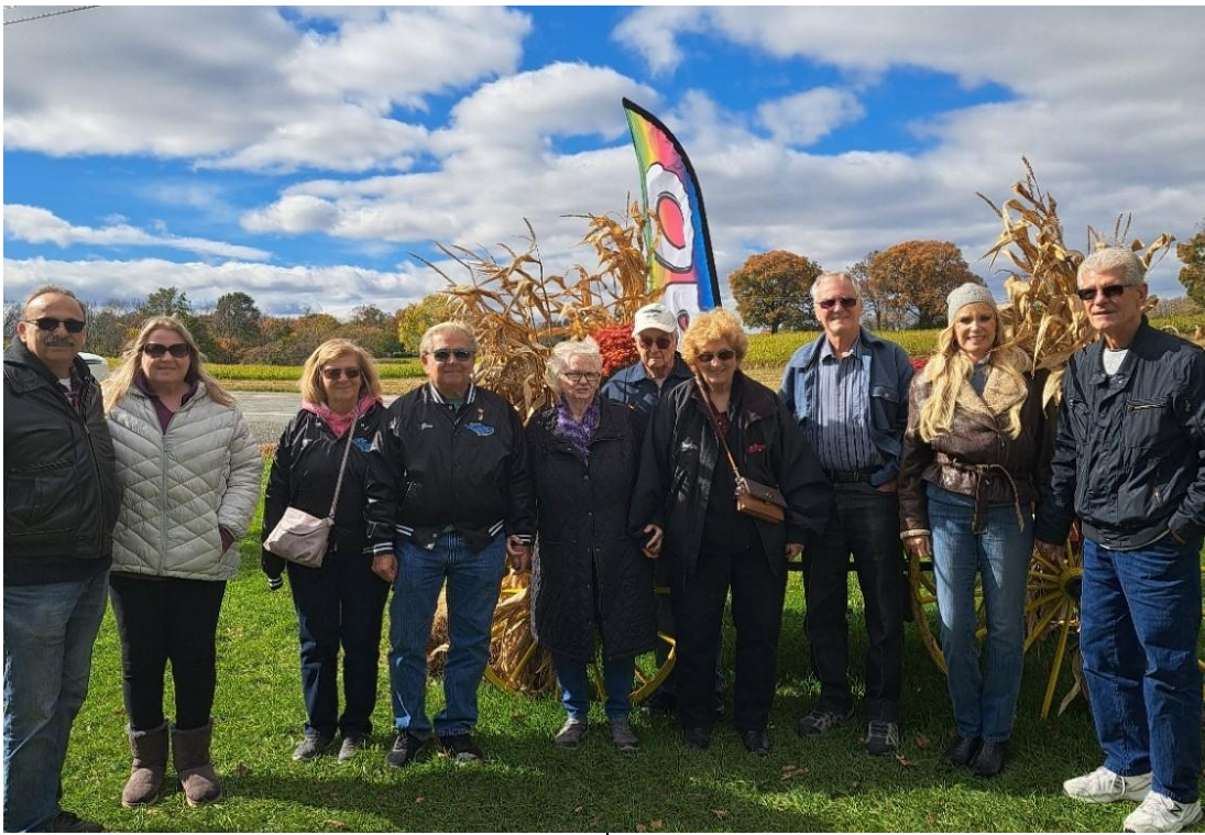
Members Out & About with their Thunderbirds