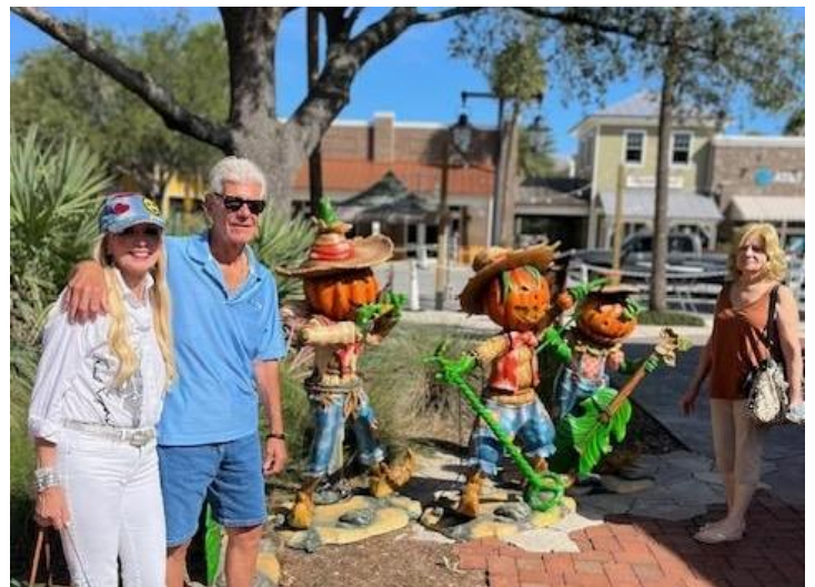
From the Villages, Florida