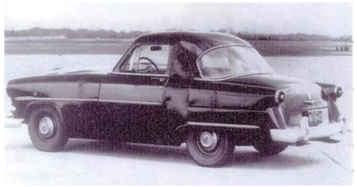
Ford test mule - TBird development ? named Brunetti

OVER $150,000 SPENT ON 12 YEAR RESTORATION JUST COMPLETED , CALL VINCE FOR DETAILS. 201-973-980-4312