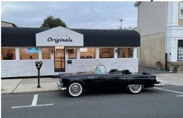
Paul A at a new hot dog joint in Westwood former Callahan's location