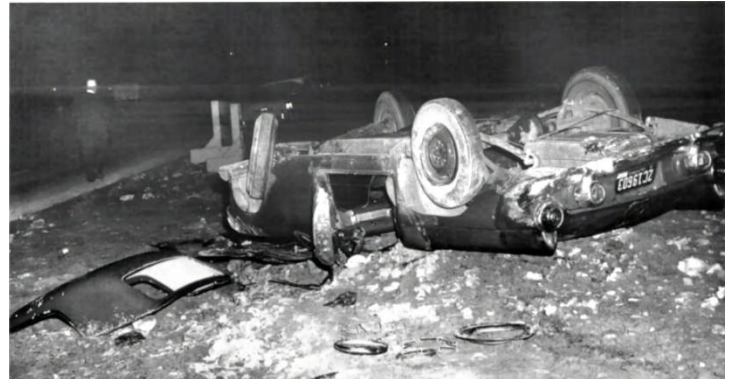
The demise of another Thunderbird