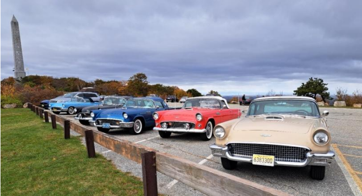
122 likes on Facebook TBird site in one week