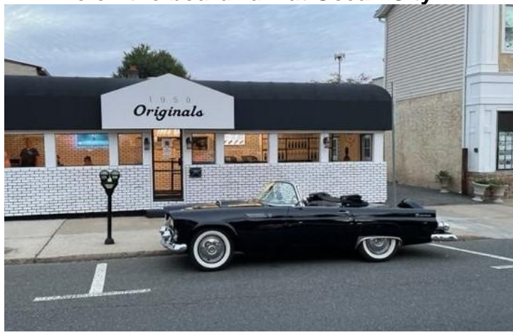
Paul A at a new hot dog joint in Westwood former Callahan's location