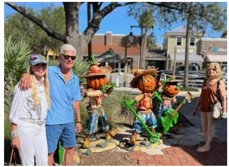
From the Villages, Florida