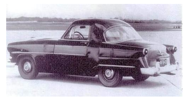
Ford test mule - TBird development ? named Brunetti

OVER $150,000 SPENT ON 12 YEAR RESTORATION JUST COMPLETED , CALL VINCE FOR DETAILS. 201-973-980-4312