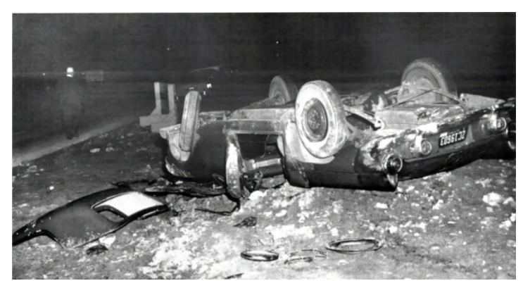
The demise of another Thunderbird