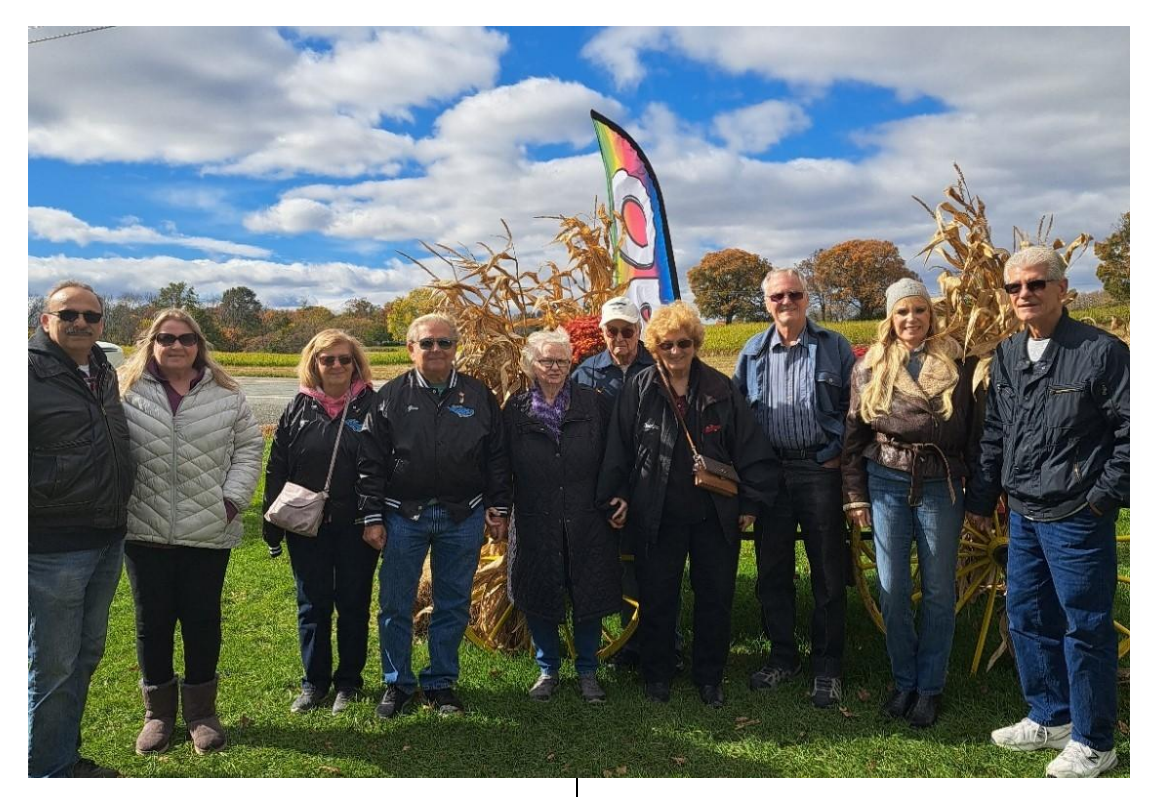
Members Out & About with their Thunderbirds