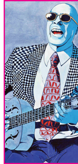
Original art by Artist Samuel Pace, Los Angeles, CA

Are you looking for original oil or watercolor painting, pottery or one of a kind sculpture? What about custom jewelry, glasswork or mixed media? The Northwest is home to many talented fine artists and crafters. The Festival invites and proudly presents a limited and select number of professional artists from Washington, Oregon, Idaho and California to display and sell their art during the Festival.