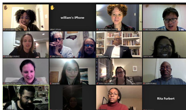
The Duke Lutherans and St. Joseph AME Racial Reconciliation Partnership