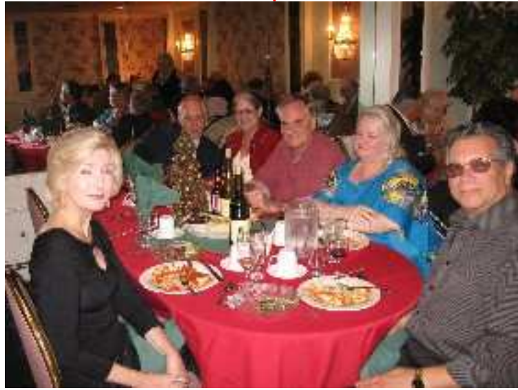
Will we or won't we have 6 more