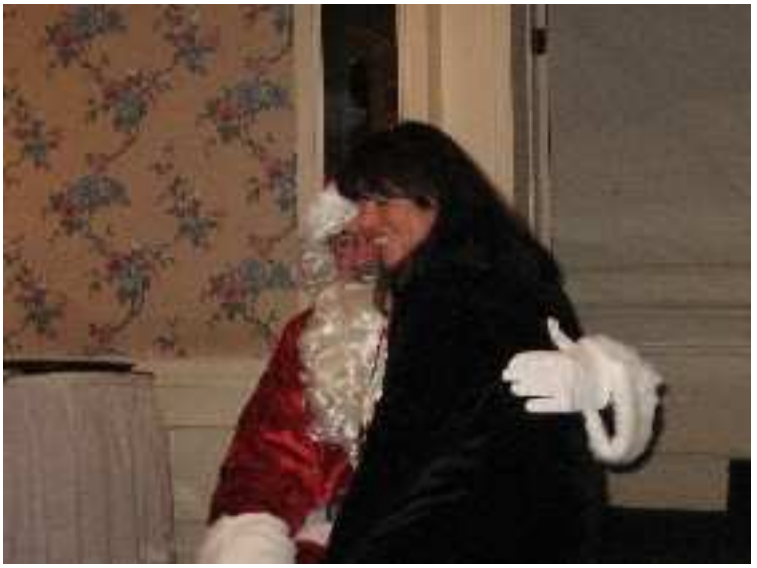
Have you been a good little girl ?