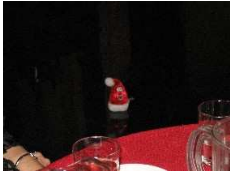
Pat brought along a little friend