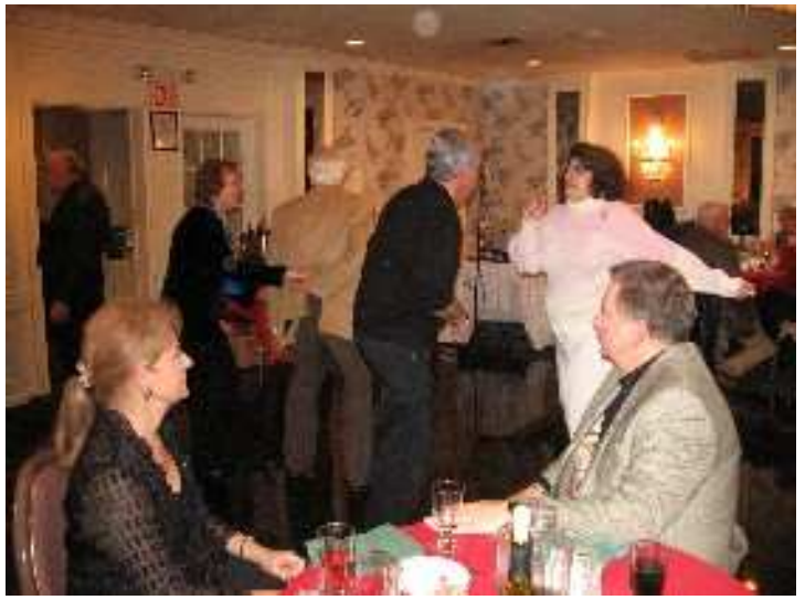
The Guidones and the Jessies cutting a Rug

The early bird gets the worm – but it's the second mouse that gets the cheese