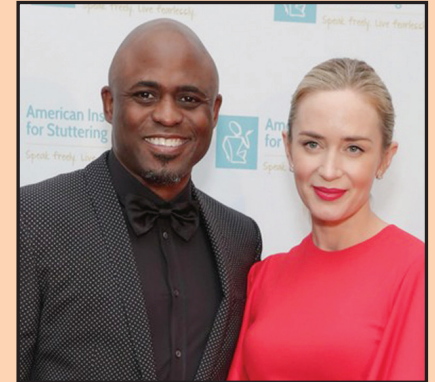
The American Institute for Stuttering held its 1th annual 'Freeing Voices' with Wayne Brady and Emily Blunt