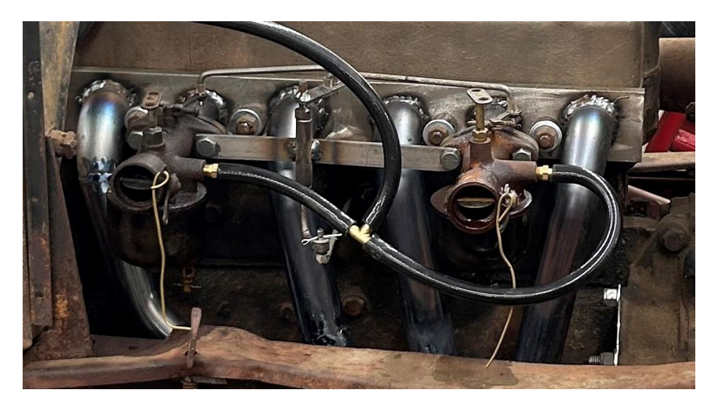
The speedster featured a custom-made manifold with dual carburetors. The exhaust pipes were pieced together and welded using a kit from Summit Racing.