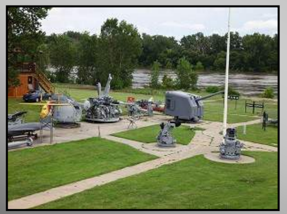
Freedom Park is an outdoor park and United States Naval Museum located along the Missouri River.