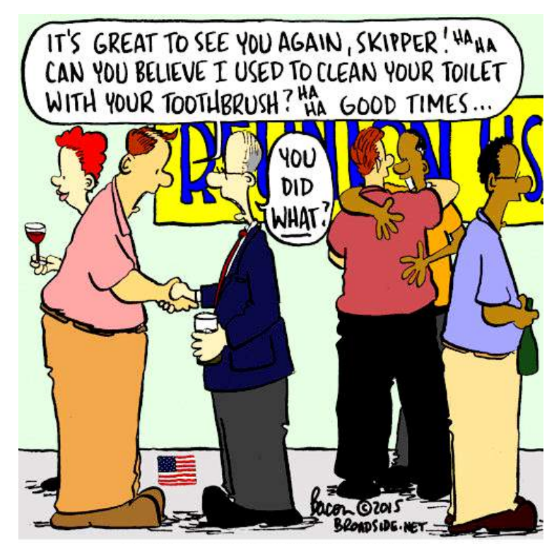
Some sea stories should not be told.

Online viewers, can't get enough of these characters? Click the Arlo and Janis logo, and it'll take you to the artists personal blog page.