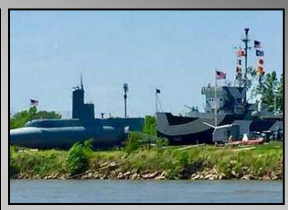
Major exhibits are a USS Marlin SST-2 and USS Hazard AM-240. The park also has a collection of jets, helicopters, rocket launchers, missiles, a Captain's Gig and more.

Wednesday is your Free-Day to go out and enjoy the city... Sightseeing, Shopping, Touring and More! Omaha offers a wide variety of Museums, Parks, Entertainment and Cuisine. <a href="https://www.visitomaha.com/">https://www.visitomaha.com/</a>