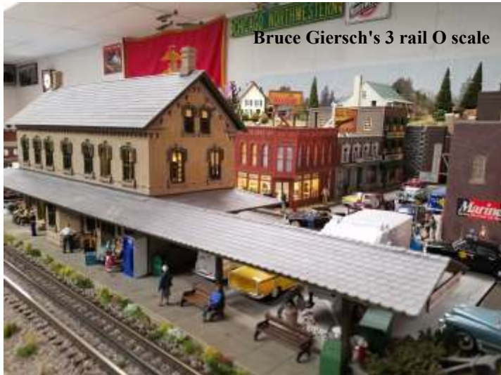
Bruce Giersch's 3 rail O scale

There were lots of layout tours in all scales that were top notch. Clinics, op sessions and other events were going on all weekend including model contests and Project Linus. If you are unfamiliar with Project Linus it is a group that has been gathering at our conventions (both regional and National) as a non-rail function. It is staffed by people that make lots of quilted blankets for children in the hospital. Attendees may take part in this very noble project.