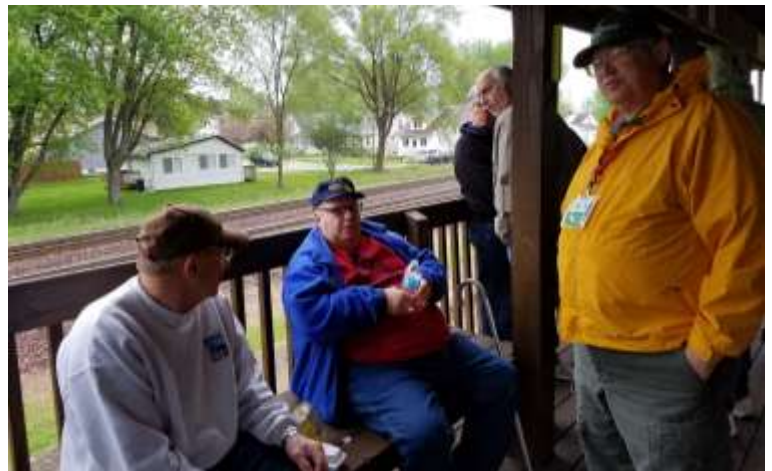
Cool weather but warm conversations!

Next Year the South Central Wisconsin Division will host the MWR convention. Planning is already underway for the Capitol 400 MWR Convention on April 13 th – 15 th 2018. Make your plans now.