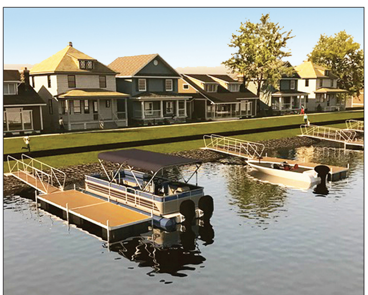
ODNR Shoreline Rendering

Docks will be floating and each home may have one. They will not be attached to the dam, but require a cat-walk from the wall to the dock for the residents to get to their docks. The entire surface, except for the visitors path will be grass. It is to be maintained by ODNR. It is clean and empty. No trees, no flowers, no docks, no tables or picnic area.