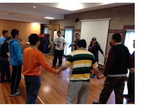
Belmore Dance Activity