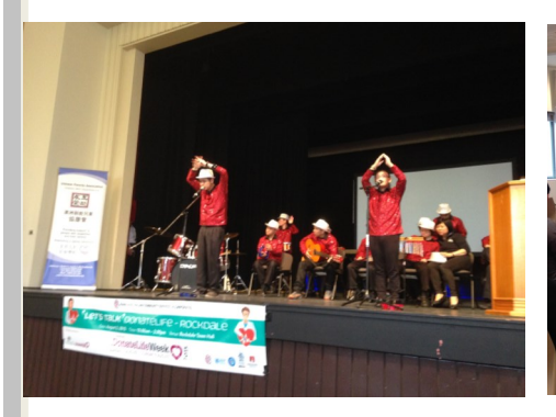
Donatelife at ROCKDALE