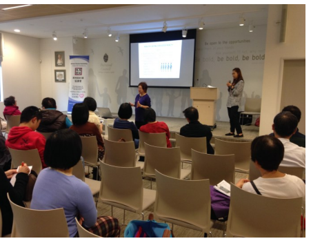
Health Seminar at Burwood