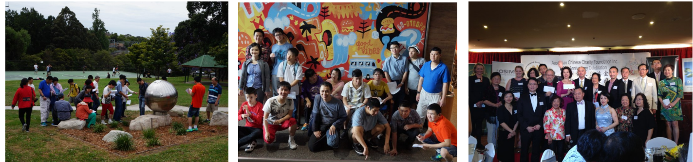
Kogarah Public-art excursion