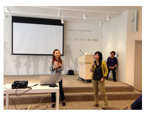
Health Seminar at Burwood