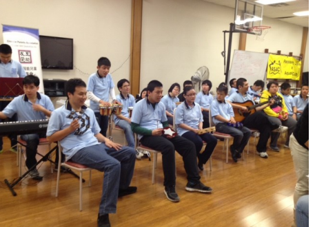
Open Day - Reaching for the stars