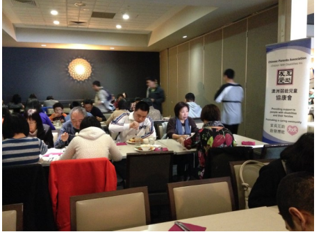
Mid-Autumn Festival Celebration