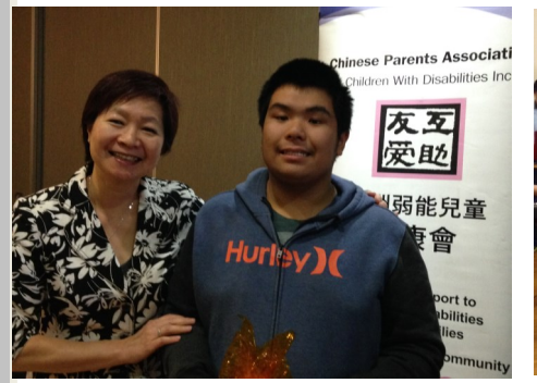
Mid-Autumn Festival Celebration