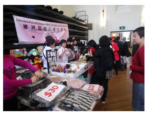
Donatelife at ROCKDALE