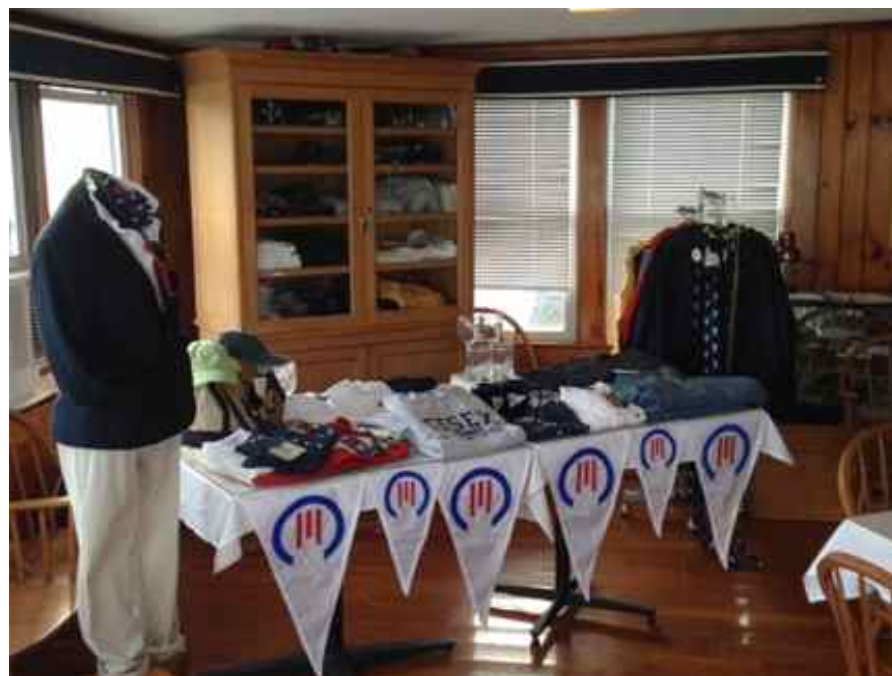
Come see what's new at the Ship's Store!

The Ship's Store has all types of fleece sweaters, vests and wind vests, as