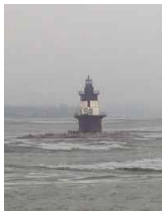
Rough conditions at the gut

Before turning in, NOAA told me to expect a wake-up call shortly before dawn. At precisely 0415, Tesoro leaned suddenly onto her port side while her bow found the new direction of the gusts. Wake-up call received. I went on deck to confirm that the predicted northwesterly had, indeed, filled in. Tesoro's haunches were down and the anchor line was tight. The sky was cloudless, the big dipper appeared within reaching distance and my anchor light looked like part of another constellation. I let out another 50 feet of scope and climbed back into my bunk listening to another autumnal tune - whistling rigging. At 0700 I brewed the coffee, boiled a couple of eggs for breakfast and gave NOAA another listen. Everything was proceeding according to plan; small craft advisories through Sunday night, NW winds 15 to 25, gusting to 35; seas 4 to 6 feet. Eldridge provided the rest of the information - NW flood would begin at 0800. The breeze was up, but the water in Coecles Harbor was as flat as a pancake. Foulies on, I put the first reef in the main while still on the anchor. In accordance with my usual routine, I sailed around the harbor while rinsing and storing the rode. Dead downwind passing marker 1, we were doing 7 knots over the water. At number 3, I chicken-gybed through 285 degrees, rolled out the jib and reached off to Plumb Gut, starboard rail buried. Like I said, what a sendoff.