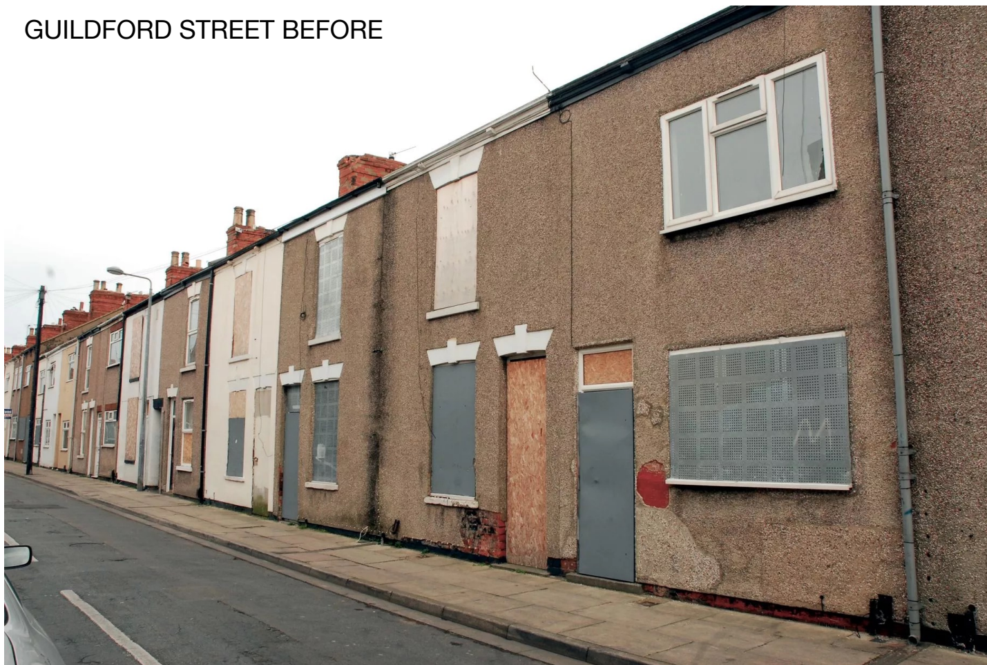
GUILDFORD STREET BEFORE

Before the regeneration in 2017 the street was notoriously crime ridden and grime ridden. The street was renowned for crime, vandalism and deprivation, and on average police were called over 500 times a year. The fire brigade attended often for arson attempts.